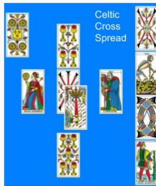
Celtic Cross Spread

Tarot card spreads are what readers use to place or layout their cards for a reading. A spread can consist of any amount of cards, from 1 to 101, it all depends on the type of reading and the question being asked. The client may ask any question and so the reader must be prepared to use a specific type of layout/spread to be able to answer the question or questions being asked. Types of spreads will vary from maybe 3 card layouts to 30 or more in a single reading. The following slides will explain and demonstrate several readings and show how to begin a reading from the start.