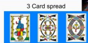
3 Card spread