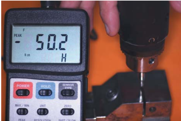
Figure 4- The digital torque meter showing the maximum torque required for loosening the screw

abutment counterclockwise, thus creating a movement to loosen the screw (Figure 2).