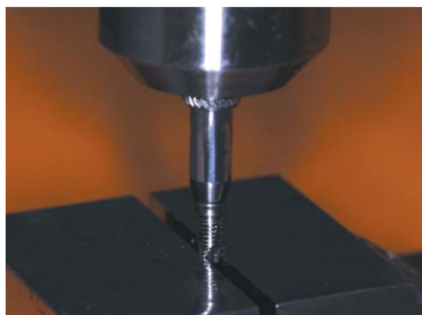
Figure 3- The wrench attached to the digital torque meter turning the hexagonal abutment counterclockwise. The abutment is held by a metal base

study, 20 hexagonal abutments (Neodent) were manufactured without a hexagon in their bases so they could be rotated on the implant platform during the loosening of the fixation screw (Figure 1). These abutments are recommended for cemented single crowns. A wrench custom made for this experiment (Neodent) was used for rotating the hexagonal