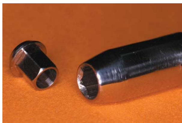
Figure 2- One of the ends of the custom-made wrench that fits onto the hexagonal abutment for loosening the screw