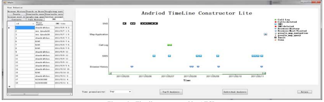
Figure 6. Timeline constructed by ATCL