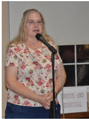
Bonnie: Survival while thriving