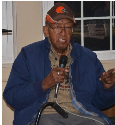
Charles: Words of Wisdom