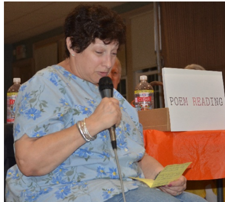
Sherry: Original Poem