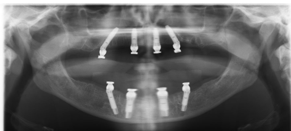
Figure 2 Postoperative panoramic radiograph following All-on-Four™ implant rehabilitation in the maxilla and mandible. The implants were immediately loaded with all-acrylic resin interim prostheses.