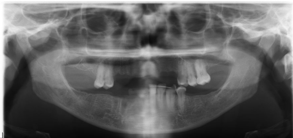
Figure 1 Preoperative panoramic radiograph of the patient elected for maxillary and mandibular All-on-Four™ implant rehabilitation.