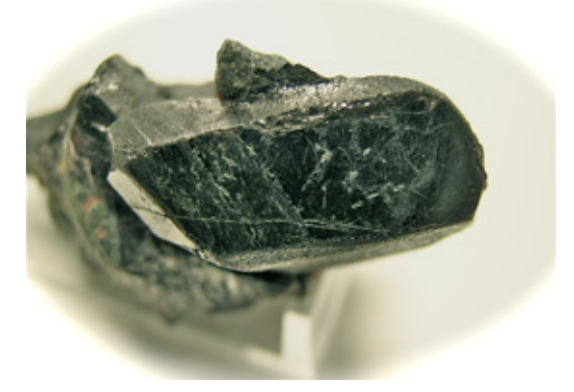
Figure 1. Ilmenite ore.

In addition, titanium is common in magnetite, with Ti-rich (2% - 20%) varieties termed titaniferous magnetite or titanomagnetite. Other less common titanium oxide-bearing minerals are pseudobrookite (Fe<sub>2</sub>TiO<sub>5</sub>), perovs-kite (CaTiO<sub>3</sub>), geikielite ((Mg, Fe)TiO<sub>3</sub>), and pyrophanite (MnTiO<sub>3</sub>) [6]. The only silicate mineral with titanium as a major component is titanite, formerly called sphene.