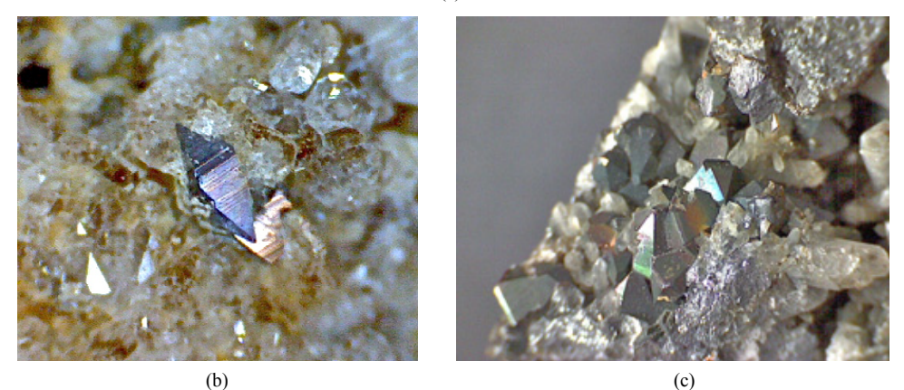
Figure 2. a) Rutile form; b) Anatase form; c) Brookite form.