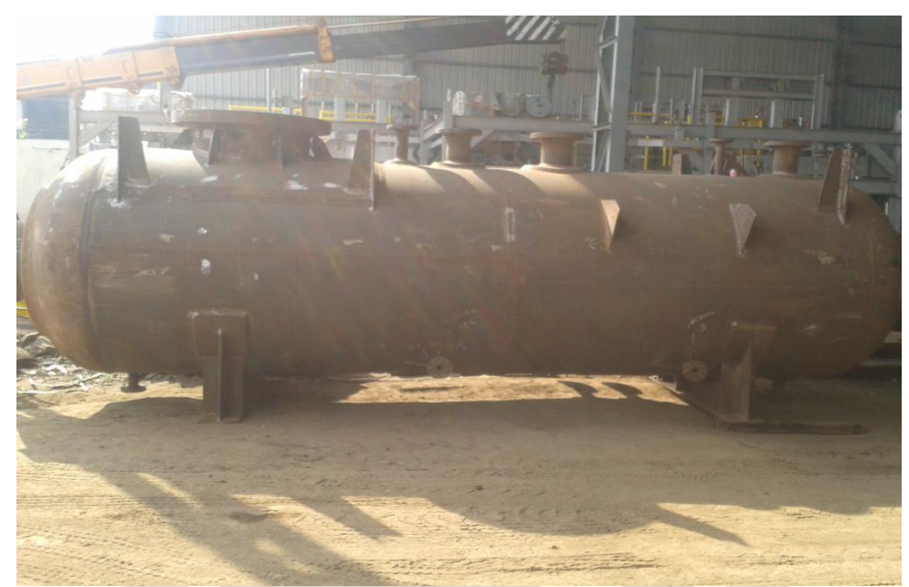
Fig.1. The typical horizontal storage vessel design