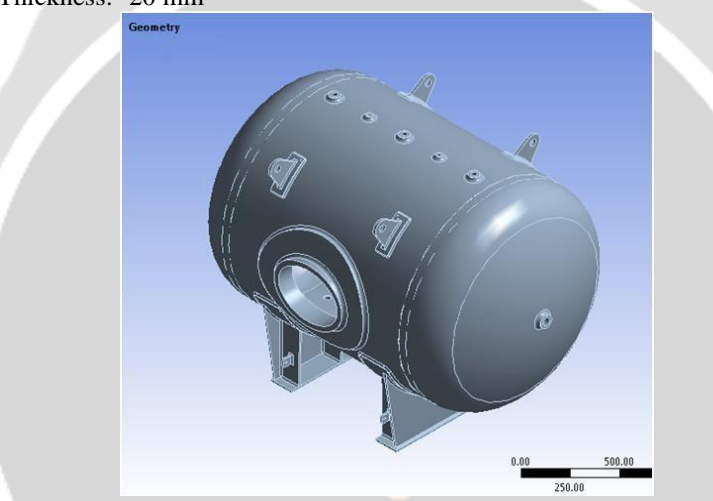
Fig. 3. Model of Air Receiver.

To achieve accuracy within satisfactory level, convergence study is conducted for 3.5MPa pressure case. Model is analyzed for variety of element sizes and a size is chosen wherein satisfactory accuracy is obtained having less computation time.