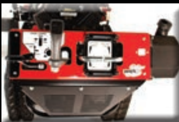
Easy controls operate the track drive and cutter wheel