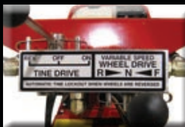
Simple controls are easy to learn and easy to operate