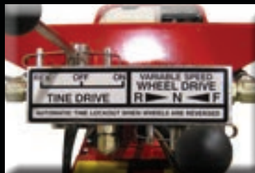
Simple controls are easy to learn and easy to operate