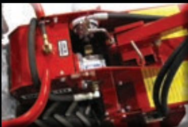
All hydraulics are easily accessed for maintenance and repair