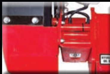
Torsion axle suspension