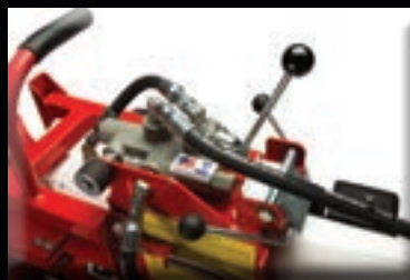
Two handed control provides operational safety