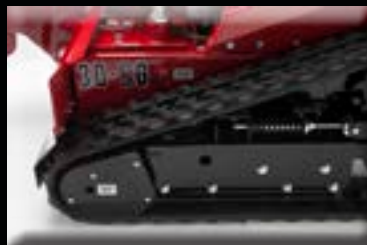
Time-tested track design absorbs impact and provides stability