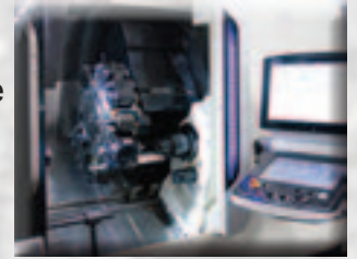
CNC Operations - Barreto manufactures over 80% of their parts in-house to ensure quality and keep parts in stock for customers

Providing a solution for every market, Barreto equipment is truly an industry exception. In addition to tillers and trenchers, Barreto Manufacturing also offers log splitters, stump grinders, wood chippers, and a range of trailers and accessories. Barreto manufactures over 80% of their components in-house to ensure quality and keep parts in stock for customers. No hassling with lead times or backorders. All equipment offered by Barreto Manufacturing is powdercoated in-house in their state of the art facility.