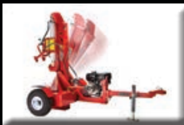
The rugged, heavy duty design will hold up to the challenges of the job