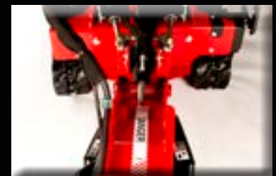
Hydraulically driven, center-mounted cutter wheel provides 134° head swing.