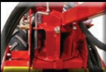
Pivoting handlebar allows closer tilling along houses or fencelines