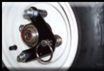
Hubs unlock to free-wheel the tiller when the engine isn't running