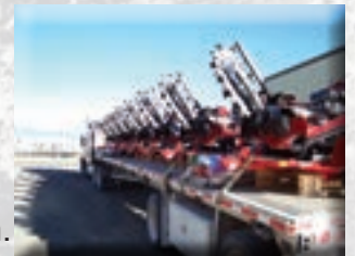
Ready to Ship