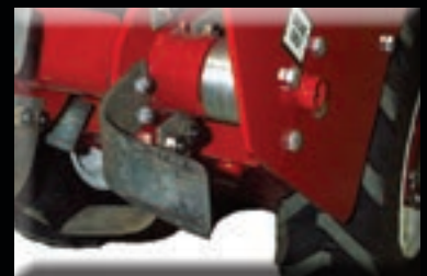
Counter-rotating tines cut through sod and hard packed soil