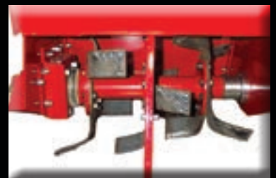
Hard faced, counter-rotating tines cut through sod and hard packed soil