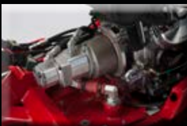
The engine is coupled to two gear pumps: a larger pump drives the cutter wheel and a smaller pump works the tilt and swing