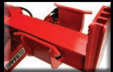
Cushion mounted log cradle is designed to snap out of the way when using the splitter in the vertical position