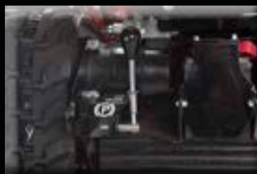
Counterbalance valves on each track drive prevent the track motors from slipping