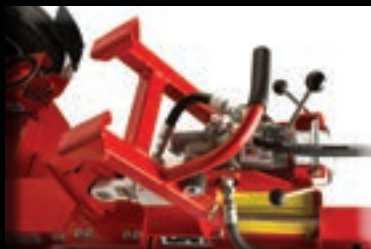
Spring loaded wedge cleaner