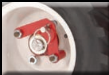
Hubs unlock to free-wheel the tiller when the engine isn't running