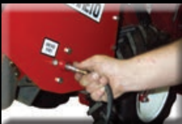
Marked grease zerks allow for easy maintenance