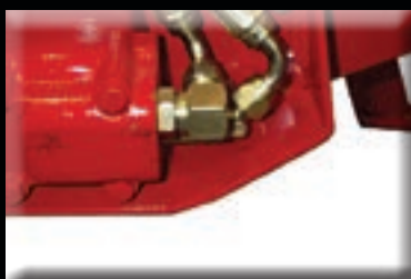
Hydraulics are easily accessed for maintenance and repair