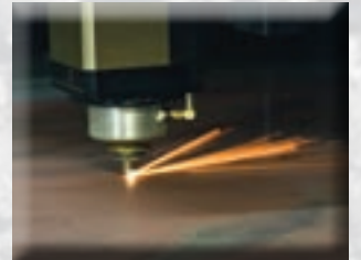
Laser Cutting Accuracy