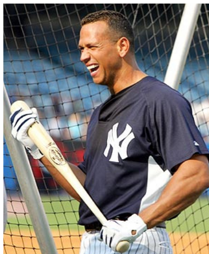
Alex Rodriguez batted .314 and hit 54 home runs for the Yankees in 2007.

Judging the fair value of a long-term contract can