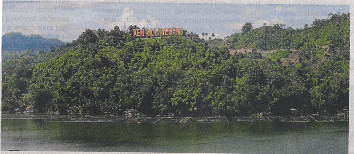
MOUNTAIN TOWN A group of farmers growing abaca, corn and banana in the scenic mountain town of Lake Sebu is starting to integrate rabbit growing into their agriculture production.

To popularize rabbit farming among T'boli tribes in Lake