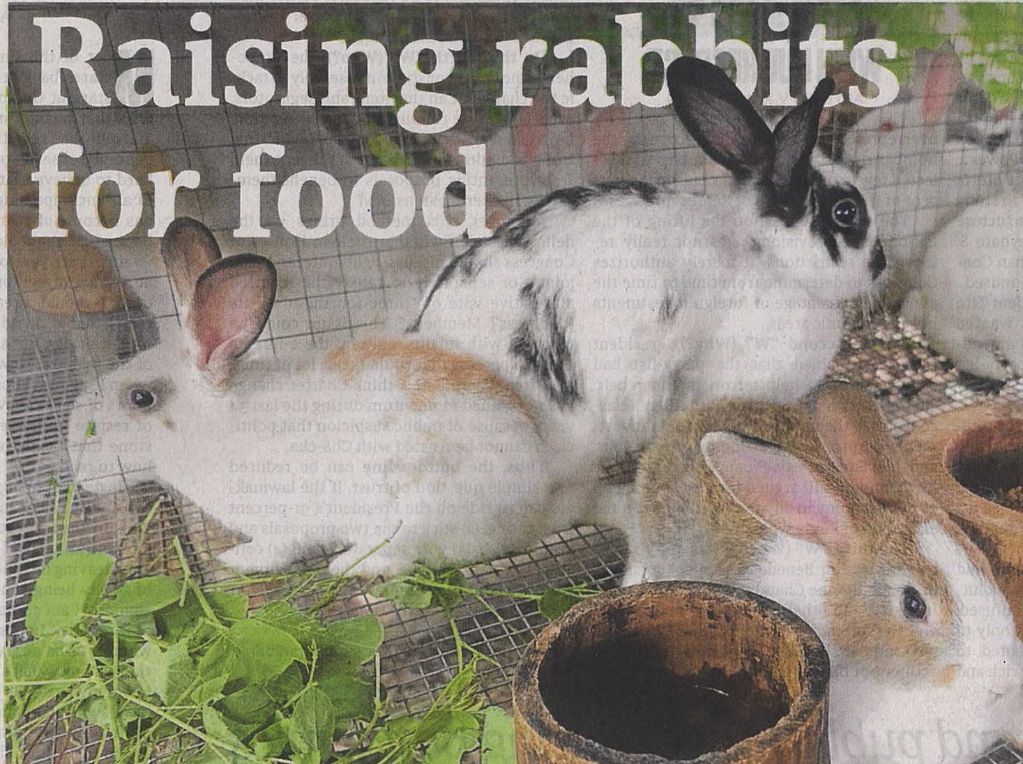
ALTERNATIVE MEAT Rabbits are raised at the Compañero family farm in Lake Sebu, South Cotabato, in an effort to introduce an alternative meat to Filipinos.

"Rabbit meat is healthier than pork and chicken. It has higher protein content, and lower fat and bad cholesterol," she told the Inquirer.