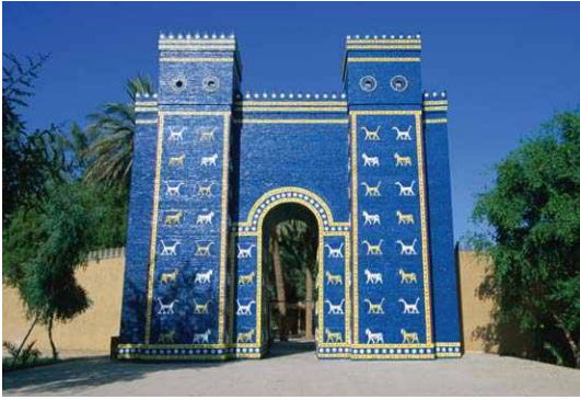
Ishtar Gate, Babylon