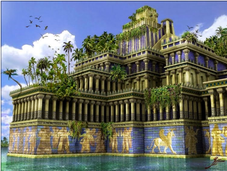
The Hanging Gardens of Babylon - one of the Seven Wonders of the Ancient World