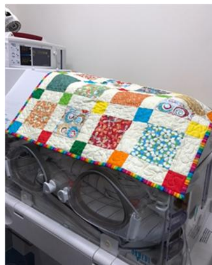
2016 donated baby quilt at work in the neonatal unit at the Children's National Medical Center

Thanks to everyone who helped us surpass our goals last year!