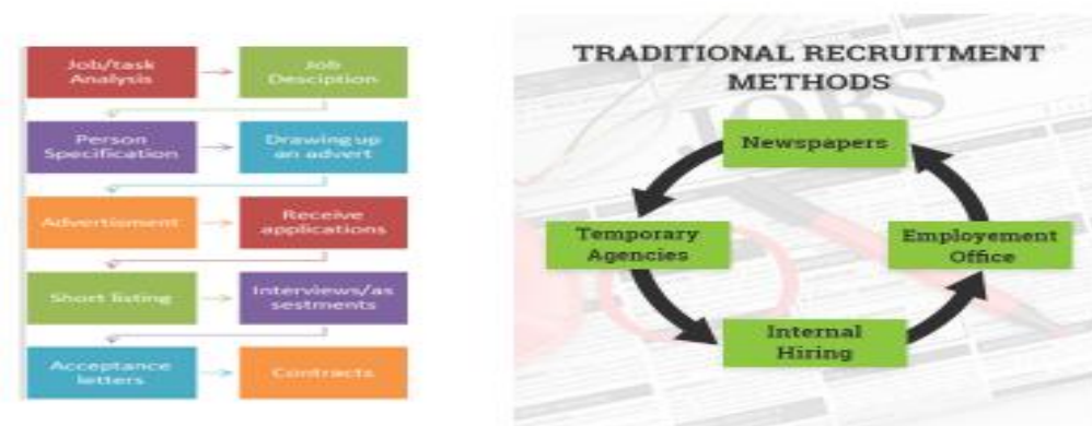
Figure 1 Traditional recruitment process

As shown in the figure traditional method consists of several stages to be managed extensively for better result. They are: