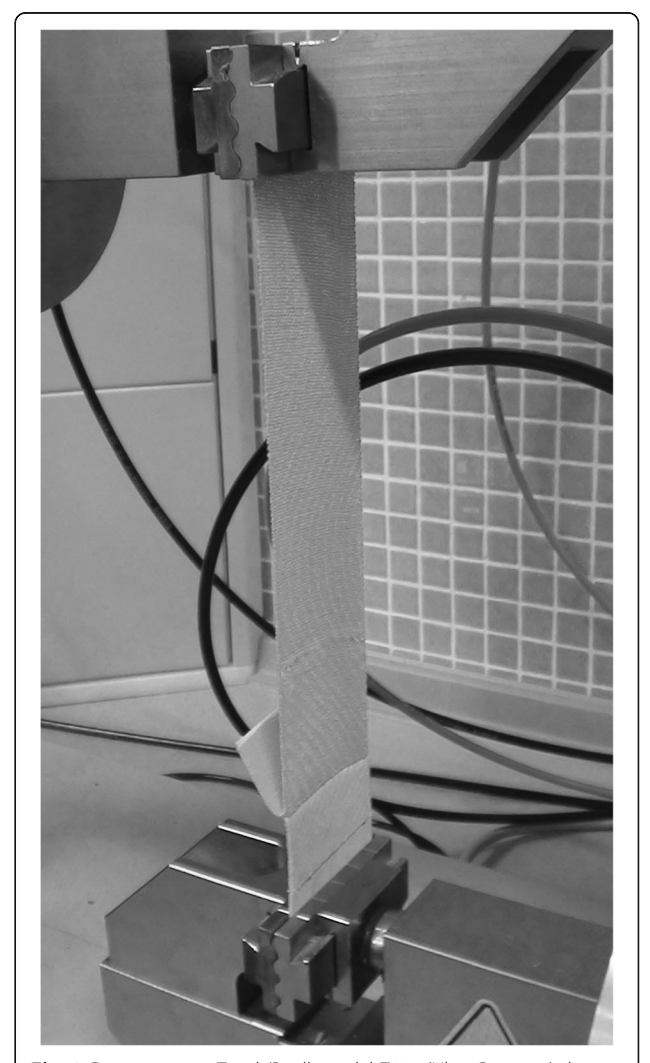
Fig. 2 Dynamometer Zwick/Roell. model Z005 (Ulm. Germany) during the adherence test of one red tape. The tape is adhered on a piece of untanned sheepskin

The KT was preloaded by stretching it without removing it from the skin until \pm 2\,\mathrm{N} of strain were reached. From this moment, the dynamometer began to separate the clamps, stretching the test piece until it came away from the skin.