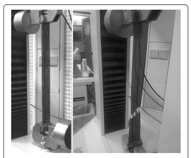
Fig. 1 Dynamometer Zwick/Roell. model Z005 (Ulm. Germany) during the strain test of one black tape. The appearance of white marks in the tape indicates its immediate breakage

To evaluate the adherence force and the work done to remove the KT from skin, pieces of untanned sheepskin, 50-mm wide by 80-mm long, were included in the test. 50 mm of one end of the KT sample were stuck to the