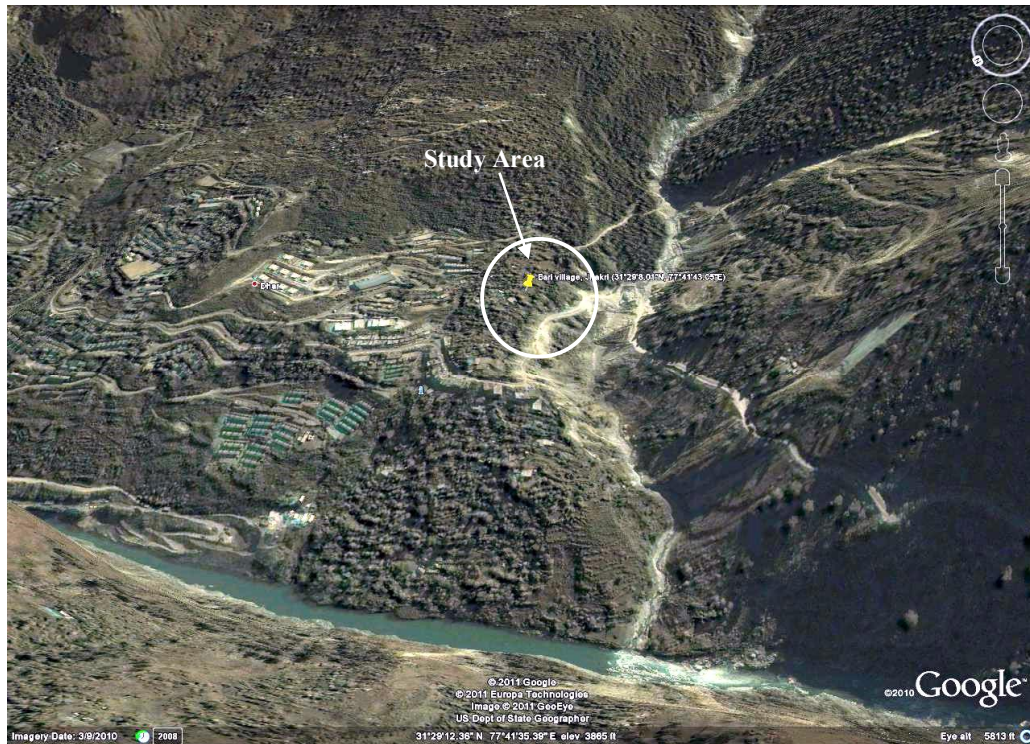
Fig. 1 - Google Earth image showing study area