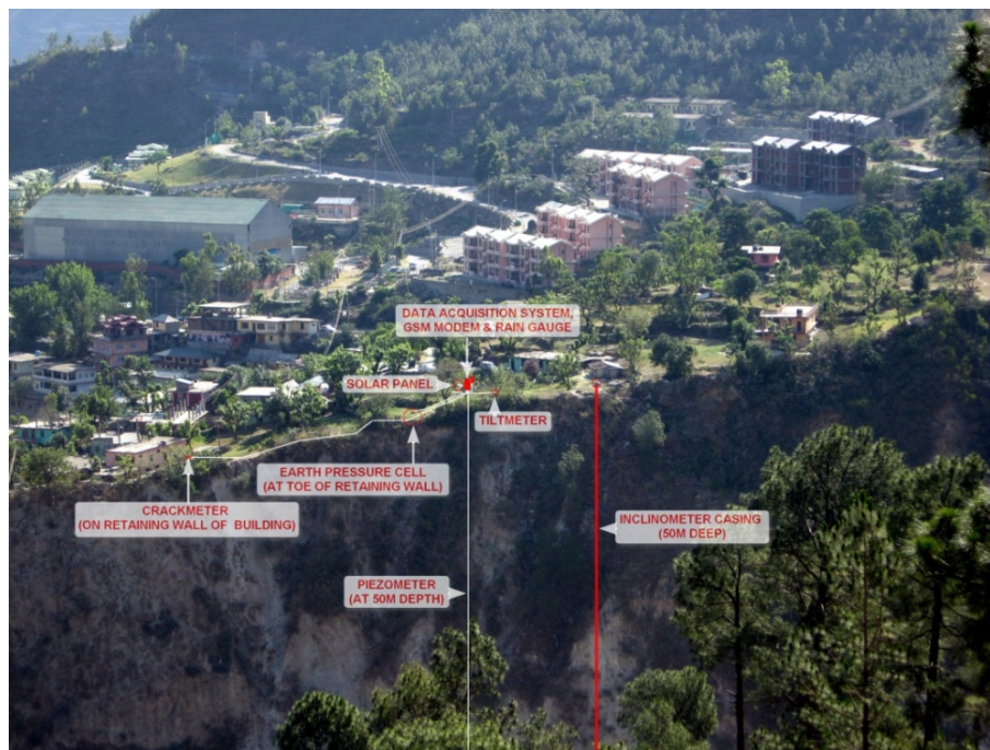
Fig. 4 - A view of instrumented landslide site from Rampur side hill