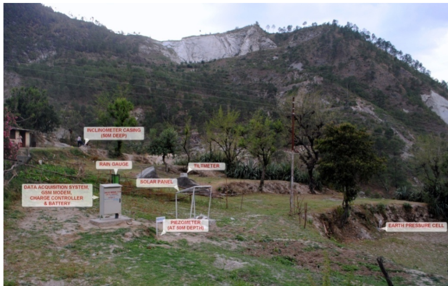
Fig. 3 - A view of instrumented landslide site from SJVNL guest house side

equipped with GSM/GPRS modem to communicate with Control Station (CS) situated at CSIR-CSIO, Chandigarh. Complete instrumentation was made operational in May 2012. CS allows the remote, automated management of FS over GSM/GPRS interface and retrieves recorded data and analyses it. To monitor the whole landslide area; more numbers of sensors can be interfaced to existing FS and also more FS can be configured and linked with CS.