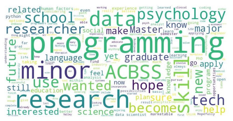
Figure 2 . Pre-survey long-term goals. The word cloud reflects commonly used words in the pre-survey in response to an open-ended question regarding long-term goals.