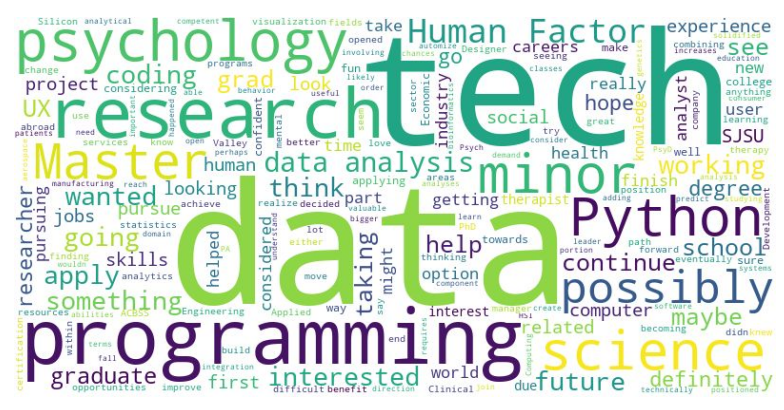
Figure 3 . Post-survey long-term goals. The word cloud reflects commonly used words in the post-survey in response to an open-ended question regarding long-term goals.

Figure 2 . Pre-survey long-term goals. The word cloud reflects commonly used words in the pre-survey in response to an open-ended question regarding long-term goals.