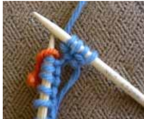
Second increase done