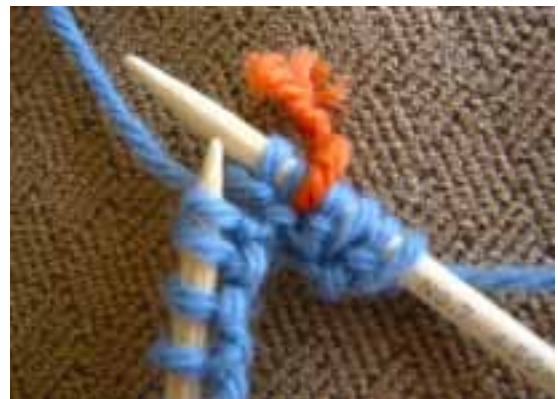
Third increase done