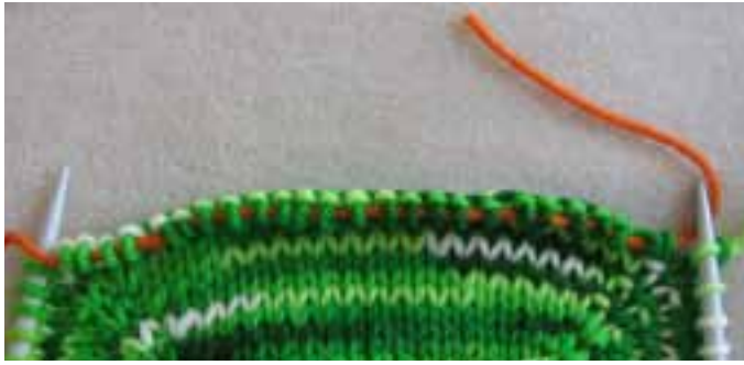
Here is the first sleeve on the yarn holder.