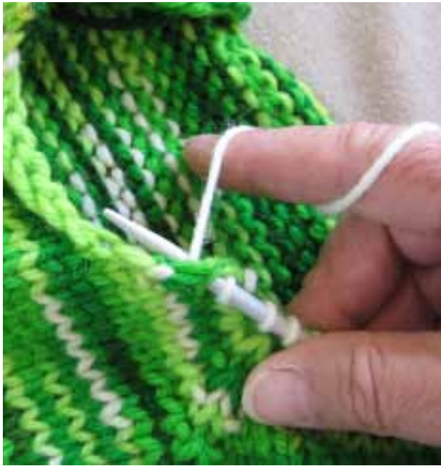
Picking up the stitches across the front of the neck opening.