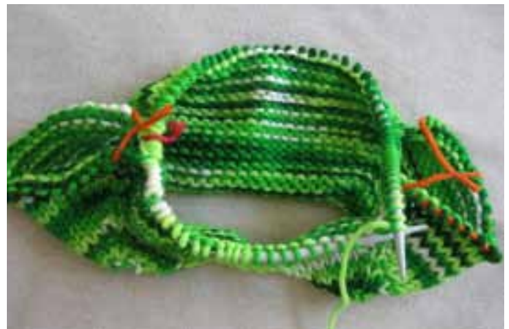
The old beginning of the round marker (pink) has been removed. The red marker is the new beginning marker. Yarn holders are tied and trimmed to stay out of the way.