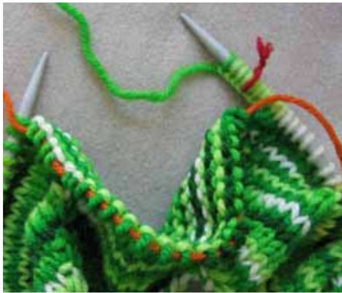
Above, the underarm stitches are cast on and a new beginning of round marker is placed. You are ready to join to the back stitches.