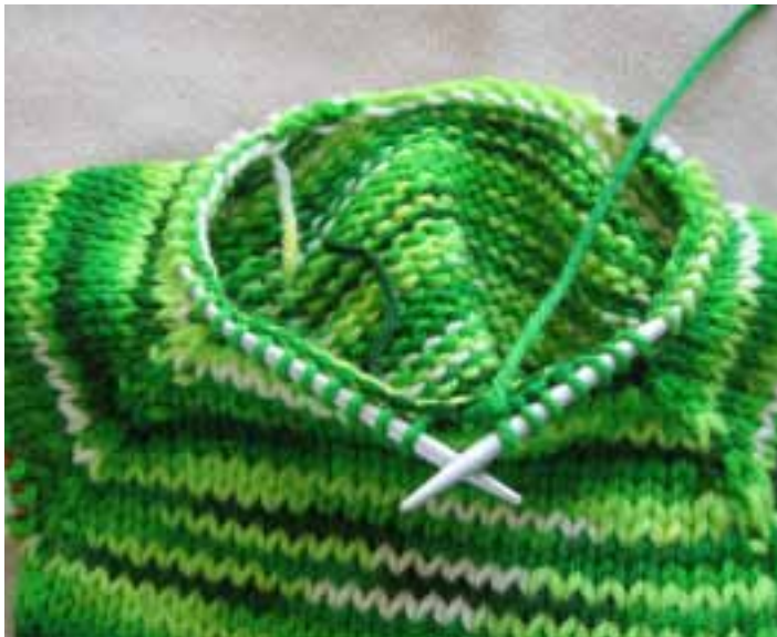
The neckband stitches are all picked up and stockinette stitch begun. Notice the 'seam' lines created by the increases. When you bind off the collar, make sure you do it very loosely. Use a needle 3 sizes larger if necessary. The neckband needs to stretch to fit over a child's head.