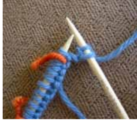
First increase done

When you follow the pattern, you will be increasing in the stitch before and after each marker, and in the first and last stitch in this row. When you get to a marker, just slip it from the left tip to the right. The knit in the front and back of the stitch increase gives you a little purl bump, which will help you keep track of increases when you begin working in the round.