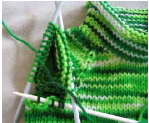
This photo shows the underarm stitches being picked up to begin knitting the sleeve.