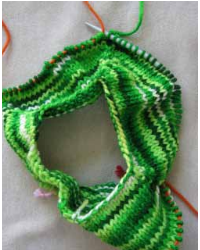
You have the left sleeve on a yarn holder, have knitted across the back stitches, and have put the right sleeve stitches on a yarn holder. You are ready to cast on more stitches and join to the front.