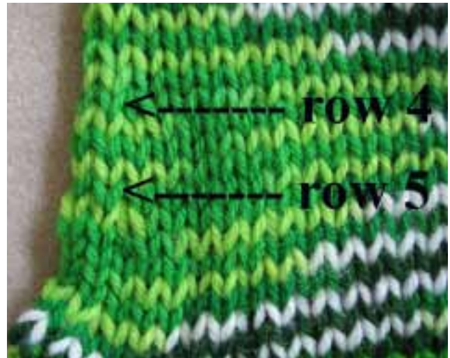
Another thing that is hard to keep track of is decrease rows. It is much easier to count rows than to try to mark each row on a sheet of paper or use a counter. Above is a close up showing how to count rows to make sure your decreases are spaced correctly. The above decrease ratio is every 5th round. Go ahead and count the rows. It might be hard to see at first, but with practice you will have an easy time knowing when to decrease.