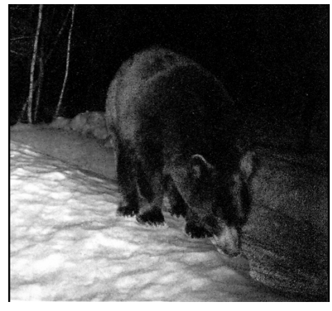
Above and right: A motion detector camera caught a black bear and a coy wolf (coyote?).