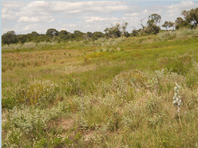
This is what the area looks like now.

This is a long term project, with a lot of different volunteer opportunities. We will be reaching out to other groups and individual members of the community to help with this project. We hope to have a social get together for all the volunteers upon completion. If you're interested in becoming involved, or would like more information, please contact us .