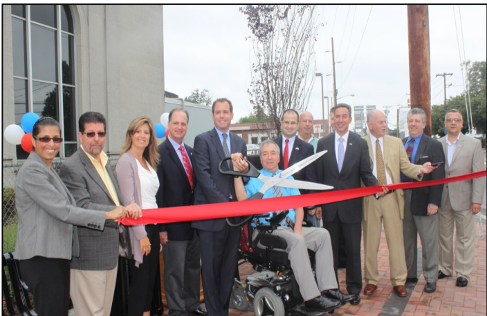
Another phase of Operation Main Street was completed in Fall 2014. Sidewalk pavers, cement planters, and site furniture provided the finishing touches at the northwest corner of Lakeville Road and Jericho Tpke.