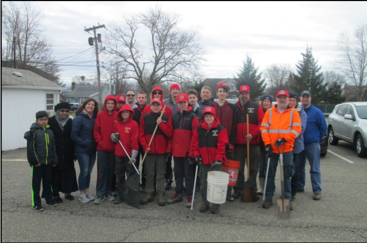
Volunteers gather in the resident parking lot on S. 12th Street to get gloves, buckets, and tools. The team did a great job.