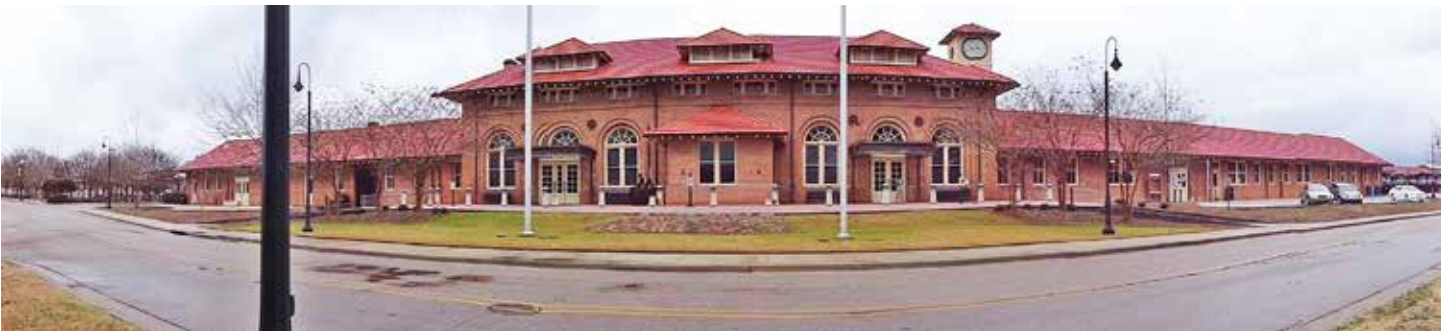
RESTORED DEPOT — The Hattiesburg depot, now restored, was built in 1910.

Although built by Heisler, it is not of the famous "Heisler" V-shaped design like engine 91 at the Mount Rainier Scenic Railroad.