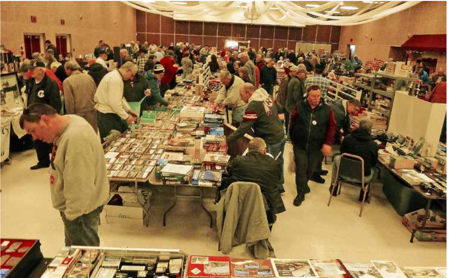
AT CHAPTER TRAIN SHOW — Patrons view numerous railroadiana items on display at Harrisburg Chapter's 32nd annual train show.