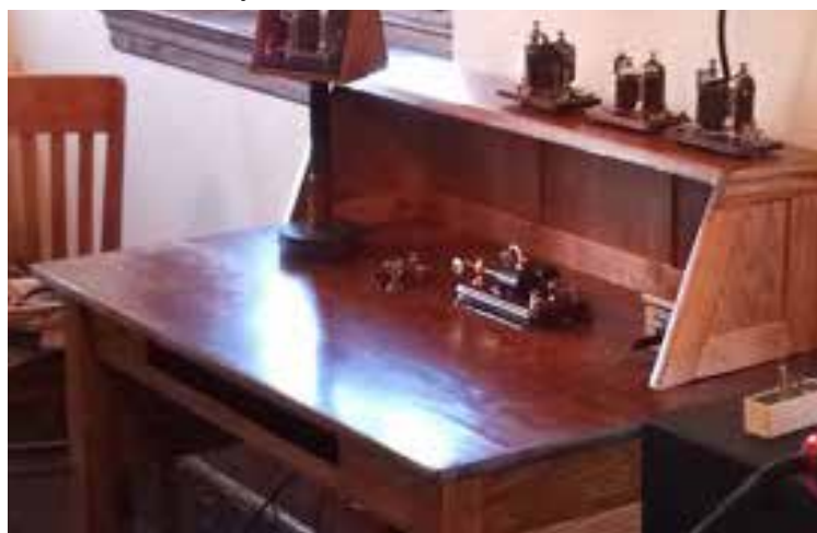
ANTIQUE SET — Visitors to Harris Tower got a chance to try this antique telegraph key.

So we had a good, if busy, day at HG. The regular opening of the tower is Memorial Day weekend at the end of May. From then through the end of October, I plan to be at the Tower for all our Saturday Wire sessions.