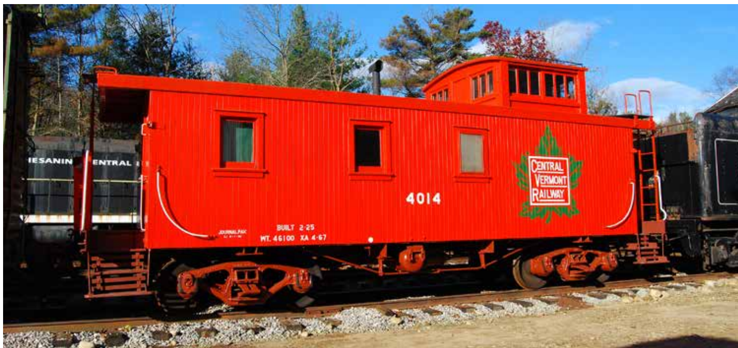
AT NEW HOME — Central Vermont Railway wooden caboose No. 4014 is now on display at the Railroad Museum of New England in Thomaston, Conn.