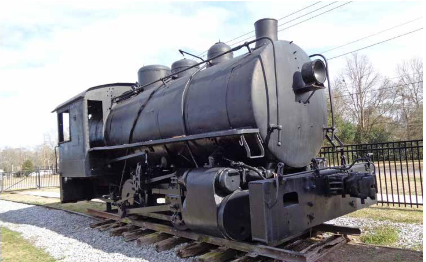
IN HATTIESBURG — This Heisler Fireless 0-4-0 locomotive is on display at the restored depot in Hattiesburg, Miss.