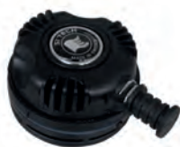
INFLATION VALVE PUSHBUTTON