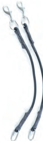
208-1320 SMS bungee kit 2pc