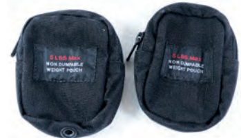
208-0030 Weight system