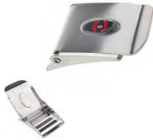
208-1028 SS buckle