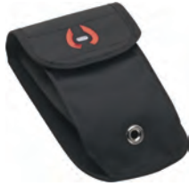
208-1029 Utility pocket