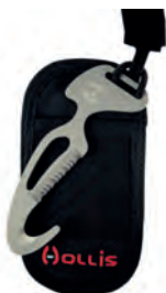
LINE CUTTER TITANIUM