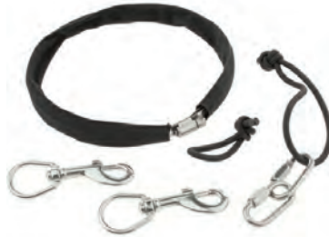
240-1650 Deco rigging kit