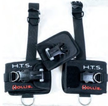
208-0040 Weight system for Elite 2, solo 208-0041 Weight system for HTS 2