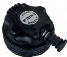
INFLATION VALVE SLIDINGACTIVATOR