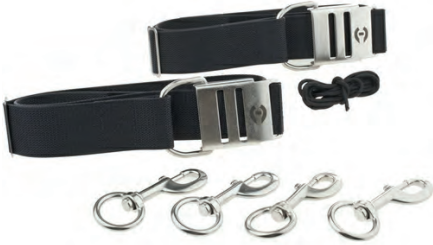
240-1550 Mains rigging kit