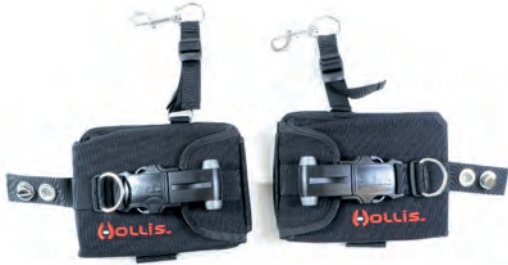
208-0010 Weight system for Elite 2, solo