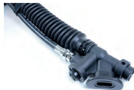
K-style inflator with oval corrugated hose.