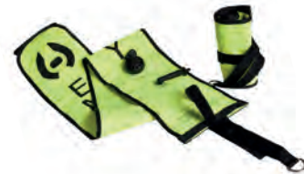
SIGNAL MARKER BUOY