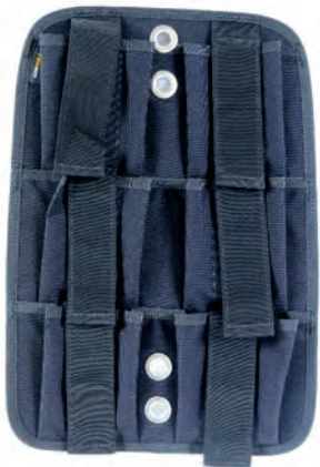
208-0042 SMS weight system For SMS 100 only