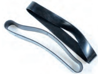
208-1322 SMS bungee 2pc