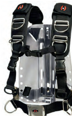
Figure with optional backplate