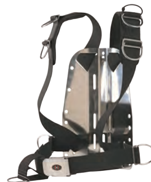
Figure with optional backplate