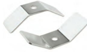
240-1034 HTS double mounting plates