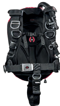
Figure with optional backplate