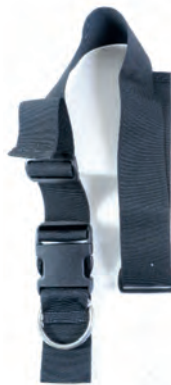
208-1032 Crotch strap 5cm