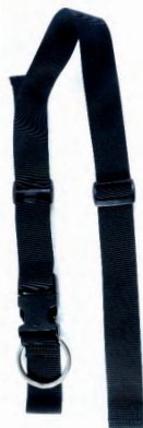
208-1027 Crotch strap 3.7cm