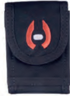
208-1031 Retractor pocket