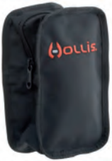
208-1030 Mask pocket