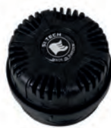
EXHAUST VALVE AUTOMATIC