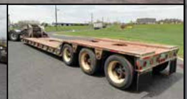
'86 ROGERS 50 TON

2007 INTERNATIONAL Model 9400i Tri-Axle Truck Tractor , powered by Cat C15, 475HP diesel engine and Eaton Fuller 18 speed transmission, equipped with 46,000# rear axle and 14,000# front axle, double frame, wetline kit, Hendrickson air ride suspension, air slide 5th wheel, Protec aluminum headache rack with work light and caution bar, 3-stage Jake brake, differential lock, power heated mirrors, power windows and locks, cruise control, aluminum wheels, and 11R24.5 tires. In good to very good condition with good tires.