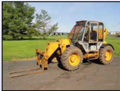
'90 JCB 505-22, 5,500#

1990 JCB Model 505-22, 5,500 lb., 4x4 Telescopic Rough Terrain Forklift , s/n 563182, powered by Perkins diesel engine and shuttle transmission, equipped with 2-stage telescopic boom, 12' reach, 22' lift height, 56" forks, and 15.5-25 tires. In fair to good condition with fair to good tires.