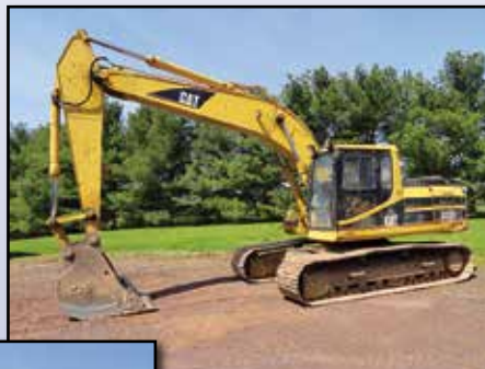
'96 CAT 320BL

1996 CATERPILLAR Model 320BL Hydraulic Excavator , s/n 6CR00192, powered by Cat 3066 diesel engine and hydraulic drive, equipped with 9'6" dipper stick, Geith 48" digging bucket, and 32" TBG pads. In good condition with good undercarriage.