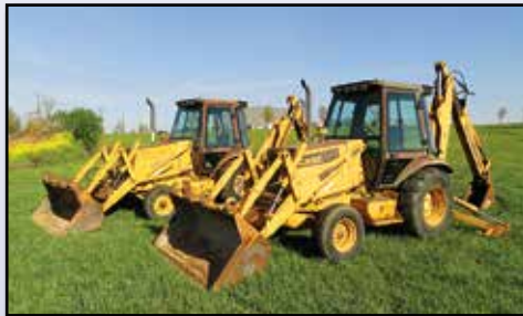
(2) '94 CASE 580 SUPER K

1994 CASE Model 580 Super K Tractor Loader Extend-A-Hoe , s/n JGG0181457, powered by Case diesel engine and shuttle transmission, equipped with general purpose loader bucket with bolt-on cutting edge, 18" digging bucket, 4-stick backhoe controls, enclosed ROPS cab, 11L-16 front and 19.5L-24 rear tires. In fair to good condition with fair tires.