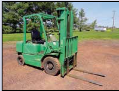
'01 KOMATSU FG25T-12, 3,750#

2001 KOMATSU Model FG25T-12, 3,750 lb. Cushion Tired Forklift , s/n 553308A, powered by dual fuel (currently running on gas) and shuttle transmission, equipped with 188" 3-stage mast, 42" forks, FOPS, and side shift. In good condition with good tires.