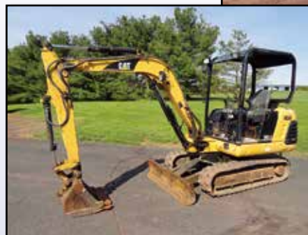
'02 CAT 302.5

1998 CATERPILLAR Model 325BL Hydraulic Excavator , s/n 6DN00758, powered by Cat 3116DITA diesel engine and hydraulic drive, equipped with 10'6" dipper stick, 30" digging bucket, enclosed ROPS cab, and 32" TBG pads. In good condition with good undercarriage.