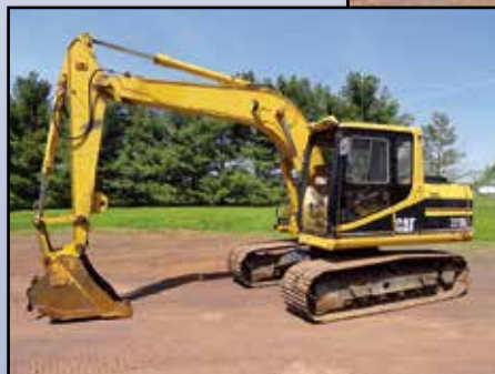
'96 CAT 311B

1996 CATERPILLAR Model 311B Hydraulic Excavator , s/n 8HR00171, powered by Cat 3064T diesel engine and hydraulic drive, equipped with 7'4" dipper stick, 28" digging bucket, and 24" TBG pads. In good condition with good undercarriage.