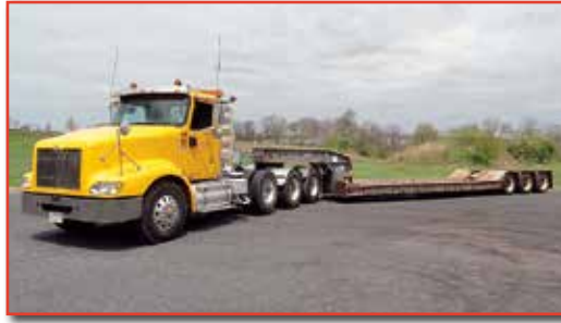
'07 INT'L 9400i AND ROGERS 50 TON