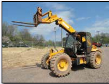
'98 JCB 530, 6,000#

1998 JCB Model 530, 6,000 lb., 4x4 Telescopic Rough Terrain Forklift , s/n 772204, powered by Perkins diesel engine and shuttle transmission, equipped with 22' 2-section boom, 48" forks, and 15.5-25 tires. In good condition with good tires.