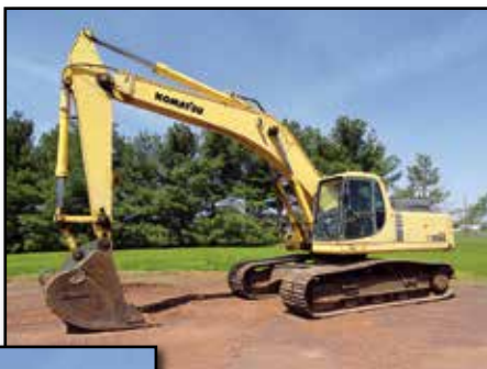
'97 KOMATSU PC300LC-6LC

1997 KOMATSU Model PC300LC-6LC Hydraulic Excavator , s/n A80608, powered by Komatsu diesel engine and hydraulic drive, equipped with 10'6" dipper stick, Esco 48" digging bucket, and 34" TBG pads. In good condition with fair undercarriage.