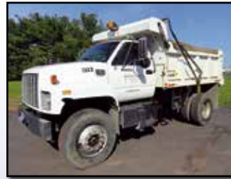
'98 CHEVY C7500

2000 FREIGHTLINER Model FL-60 Single Axle Roll-Back Truck , powered by Cummins ISB225, 5.9L, 225HP diesel engine and 6 speed transmission, equipped with Vulcan 19'x96" steel roll-back body with wheel lift hoist, Ramsey winch, 17,000# rear and 8,000# front axle, 25,000# GVWR, headache rack with light bar, hydraulic brakes, power windows, cruise control, air conditioning, and 245/70R19.5 tires. In good condition with good tires.