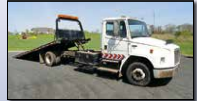
'00 FREIGHTLINER FL-60

2000 FREIGHTLINER Model FL-60 Single Axle Roll-Back Truck , powered by Cummins ISB225, 5.9L, 225HP diesel engine and 6 speed transmission, equipped with Vulcan 19'x96" steel roll-back body with wheel lift hoist, Ramsey winch, 17,000# rear and 8,000# front axle, 25,000# GVWR, headache rack with light bar, hydraulic brakes, power windows, cruise control, air conditioning, and 245/70R19.5 tires. In good condition with good tires.