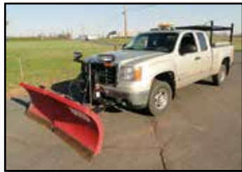
'07 GMC 2500HD SIERRA SLE 4X4

2007 GMC Model 2500HD Sierra SLE 4x4 Extended Cab Pickup Truck , powered by 6.0L, V-8 gas engine and automatic transmission, equipped with 6'6" bed, side boxes and material rack, Boss 8'2" power-V plow with Smart Hitch 2, power windows and locks, cruise control, air conditioning, alloy wheels, and LT245/75R16 tires. In good condition with good tires.