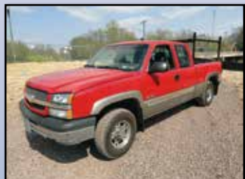
'03 CHEVY 2500 SILVERADO LS 4X4

2006 CHEVROLET Model 1500 Silverado Z71, 4x4 Extended Cab Pickup Truck , powered by Vortec 5.3L, V-8 gas engine and automatic transmission, equipped with 6'5" bed, cross tool box and material rack, power windows and locks, cruise control, air conditioning, alloy wheels, and P265/70R17 tires. In good condition with good to very good tires.