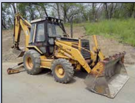
'95 CAT 416B 4X4 EXTEND-A-HOE

1994 CASE Model 580 Super K Tractor Loader Backhoe , s/n JGG0181868, powered by Case diesel engine and shuttle transmission, equipped with general purpose loader bucket with bolt-on cutting edge, 18" digging bucket, rear auxiliary hydraulics, 3-stick backhoe controls, enclosed ROPS cab, 11-16 front and 19.5-24 rear tires. In fair to good condition with fair to good tires.