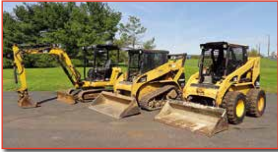
MINI EXCAVATOR AND SKID STEERS