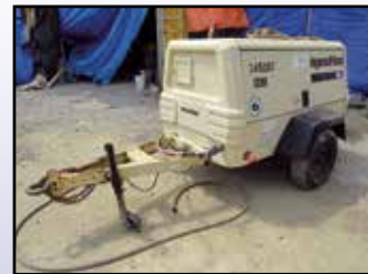
'04 IR 185CFM

2000 RAMMAX Model RW1404 Trench Compactor , s/n 328662, powered by Hatz diesel engine and hydrostatic transmission, equipped with (2) 33" split padfoot drums and drum cleaners. In fair to good condition.