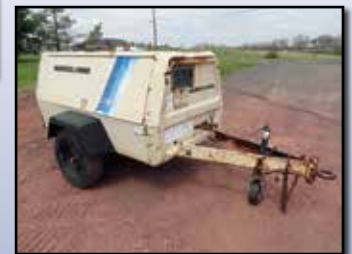
'90 IR 185CFM

2004 INGERSOLL-RAND Model P185WIR, 185CFM Portable Air Compressor , s/n 345287UD0820, powered by JD diesel engine, equipped with ST205/75D15 tires. In good condition.