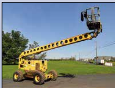
'95 GROVE AMZ66XT

1995 GROVE Model AMZ66XT, 4x4 Aerial Lift , s/n 31970, powered by Deutz diesel engine and hydrostatic transmission, equipped with 60' platform height, 600 lb. man basket with rotate and level, electric outlet, articulated boom, 2-stage telescopic, and 15-19.5 tires. In fair to good condition with fair to good tires.