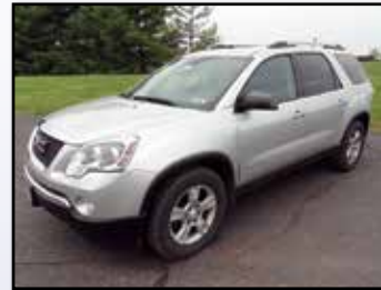
'11 GMC ACADIA AWD

2011 GMC Model Acadia AWD 4-Door SUV , powered by 3.6L, V-6 gas engine and automatic transmission, equipped with full power package, cloth interior, air conditioning, and alloy wheels. In good condition with good tires.