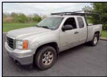
'09 GMC 1500 SIERRA SLE 4X4

2009 GMC Model 1500 Sierra SLE 4x4 Extended Cab Pickup Truck , powered by Vortec 5.3L, V-8 gas engine and automatic transmission, equipped with 6.5' bed with cap and side boxes, alloy wheels, air conditioning, power windows and locks, cruise control, and alloy wheels. In good condition with good tires.