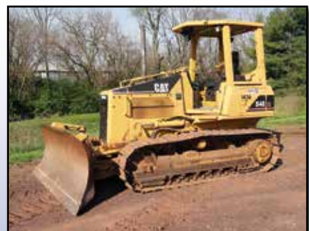
'02 CAT D4GXL

2002 CATERPILLAR Model D4GXL Crawler Tractor , s/n CFN00503, powered by Cat 3026 diesel engine and hydrostatic transmission, equipped with 6-way straight blade, ROPS canopy, and 16" SBG pads. In good condition with fair to good undercarriage.