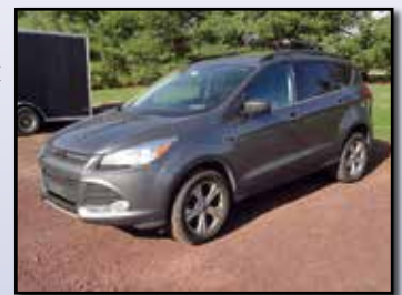
'13 FORD ESCAPE SE AWD

2013 FORD Model Escape SE AWD 4-Door SUV , powered by 1.6L Eco Boost gas engine and automatic transmission, equipped with power windows and locks, cruise control, Microsoft Sync communication system, keyless entry, alloy wheels, and 235/55ZR17 tires. In good condition with good tires.