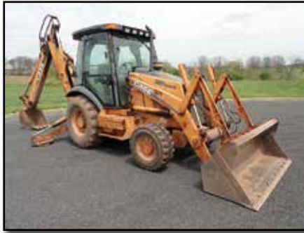
'01 CASE 580SM 4X4 EXTEND-A-HOE

2001 CASE Model 580 Super M, 4x4 Tractor Loader Extend-A-Hoe , s/n JGG0280452, powered by Case diesel engine and shuttle transmission, equipped with general purpose loader bucket with bolt-on cutting edge, 24" digging bucket, ride control, 4-stick backhoe controls, enclosed ROPS cab with heat and air conditioning, 12-16.5 front and 19.5L-24 rear tires. In good condition with fair tires.