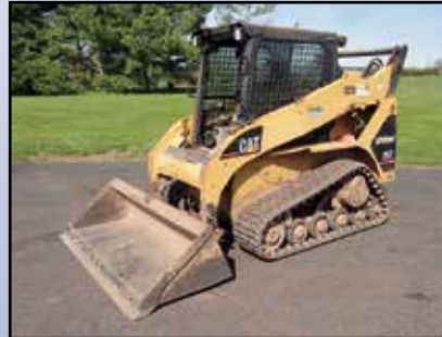
'03 CAT 257

2003 CATERPILLAR Model 257 Crawler Skid Steer Loader , s/n CMM01389, powered by Perkins diesel engine and hydrostatic transmission, equipped with general purpose loader bucket, auxiliary hydraulics, 8-pin electric, joystick controls, enclosed ROPS cab with heat, and 15" rubber tracks. In good condition with good rubber tracks.