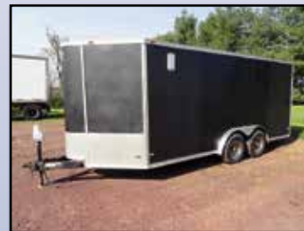
'05 J&J CARGO EXPRESS SHADOW MASTER

2005 J&J CARGO EXPRESS Shadow Master 22'x7' Tandem Axle Enclosed Utility Trailer , equipped with 77" interior height, 6'x6" drop down door, curbside door, 12V hitch jack, 2-5/16 ball hitch, spring suspension, front adjustable shelving, Unitrac tie downs, interior 12V lighting, 7,000# GVWR, and ST225/75R15 tires. In good condition with good tires.