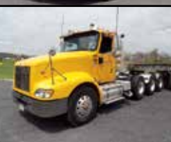
'07 INT'L 9400i