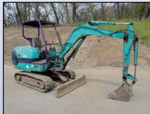
'98 KOMATSU PC27R-8

1998 KOMATSU Model PC27R-8 Mini Excavator , s/n 11519, powered by Komatsu diesel engine and hydraulic drive, equipped with 47" dipper stick with hydraulic beyond, 14" digging bucket, 59" backfill blade, ROPS canopy, and 12" rubber tracks. In fair to good condition with fair tracks.