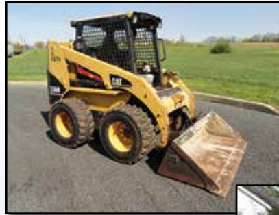
'05 CAT 236B

2005 CATERPILLAR Model 236B Skid Steer Loader , s/n HEN01993, powered by Cat diesel engine and hydrostatic transmission, equipped with 74" general purpose loader bucket, standard auxiliary hydraulics, 8-pin electric, ROPS canopy, joystick controls, and 12-16.5 tires. In good condition with very good tires.