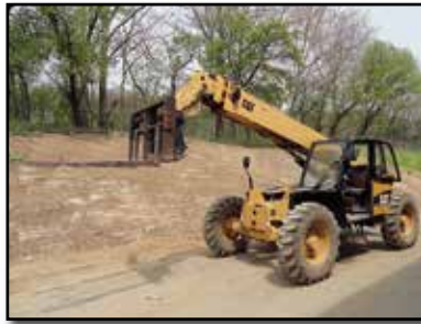
'04 CAT TH360B, 6,000#

2004 CATERPILLAR Model TH360B, 6,000 lb. Telescopic Rough Terrain Forklift , s/n SLE00916, powered by Cat 3054 diesel engine and powershift transmission, equipped with 45' 3-section boom, 60" and 48" forks, hydraulic quick coupler, auxiliary hydraulics, 5-pin electric, enclosed ROPS cab, and 13.00-24TS tires. In good condition with very good tires. (Reserved For Use During Loadout Until Thursday, June 2nd at 12:00 Noon)