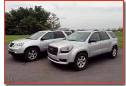
'14 AND '11 GMC ACADIA AWD