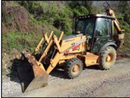
'01 CASE 580SM 4X4

1994 CASE Model 580 Super K Tractor Loader Extend-A-Hoe , s/n JGG0181457, powered by Case diesel engine and shuttle transmission, equipped with general purpose loader bucket with bolt-on cutting edge, 18" digging bucket, 4-stick backhoe controls, enclosed ROPS cab, 11L-16 front and 19.5L-24 rear tires. In fair to good condition with fair tires.