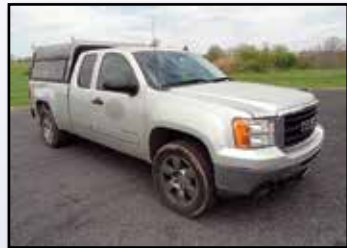
'10 GMC 1500 SIERRA SLE 4X4

2009 GMC Model 1500 Sierra SLE 4x4 Extended Cab Pickup Truck , powered by Vortec 5.3L, V-8 gas engine and automatic transmission, equipped with 6.5' bed with cap and side boxes, alloy wheels, air conditioning, power windows and locks, cruise control, and alloy wheels. In good condition with good tires.