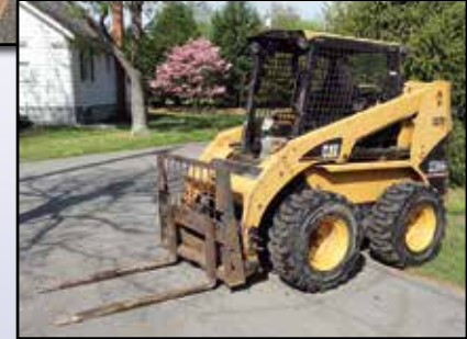
'05 CAT 236B (FORKS SOLD SEPARATELY)

2005 CATERPILLAR Model 236B Skid Steer Loader , s/n HEN01993, powered by Cat diesel engine and hydrostatic transmission, equipped with 74" general purpose loader bucket, standard auxiliary hydraulics, 8-pin electric, ROPS canopy, joystick controls, and 12-16.5 tires. In good condition with very good tires.