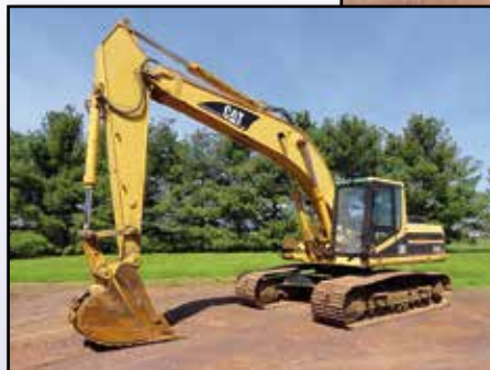
'98 CAT 325BL

1998 CATERPILLAR Model 325BL Hydraulic Excavator , s/n 6DN00758, powered by Cat 3116DITA diesel engine and hydraulic drive, equipped with 10'6" dipper stick, 30" digging bucket, enclosed ROPS cab, and 32" TBG pads. In good condition with good undercarriage.