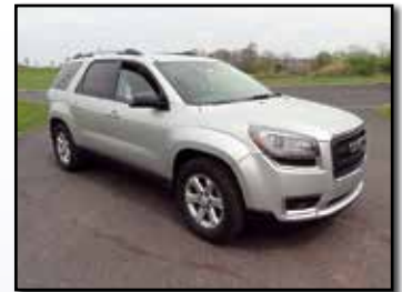
'14 GMC ACADIA AWD

2014 GMC Model Acadia AWD 4-Door SUV , powered by 3.6L, V-6 gas engine and automatic transmission, equipped with full power package, cloth interior, air conditioning, alloy wheels, and P255/65R18 tires. In good to very good condition with good tires.