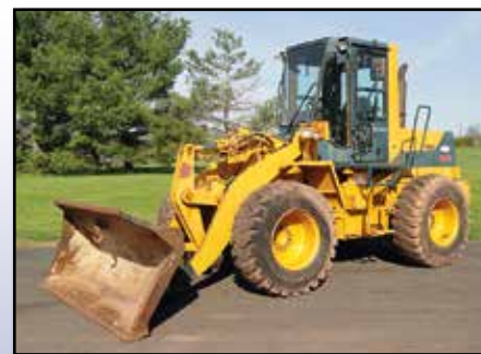
'92 KOMATSU WA180-1 (SOLD WITH FORK ATTACHMENT ONLY)