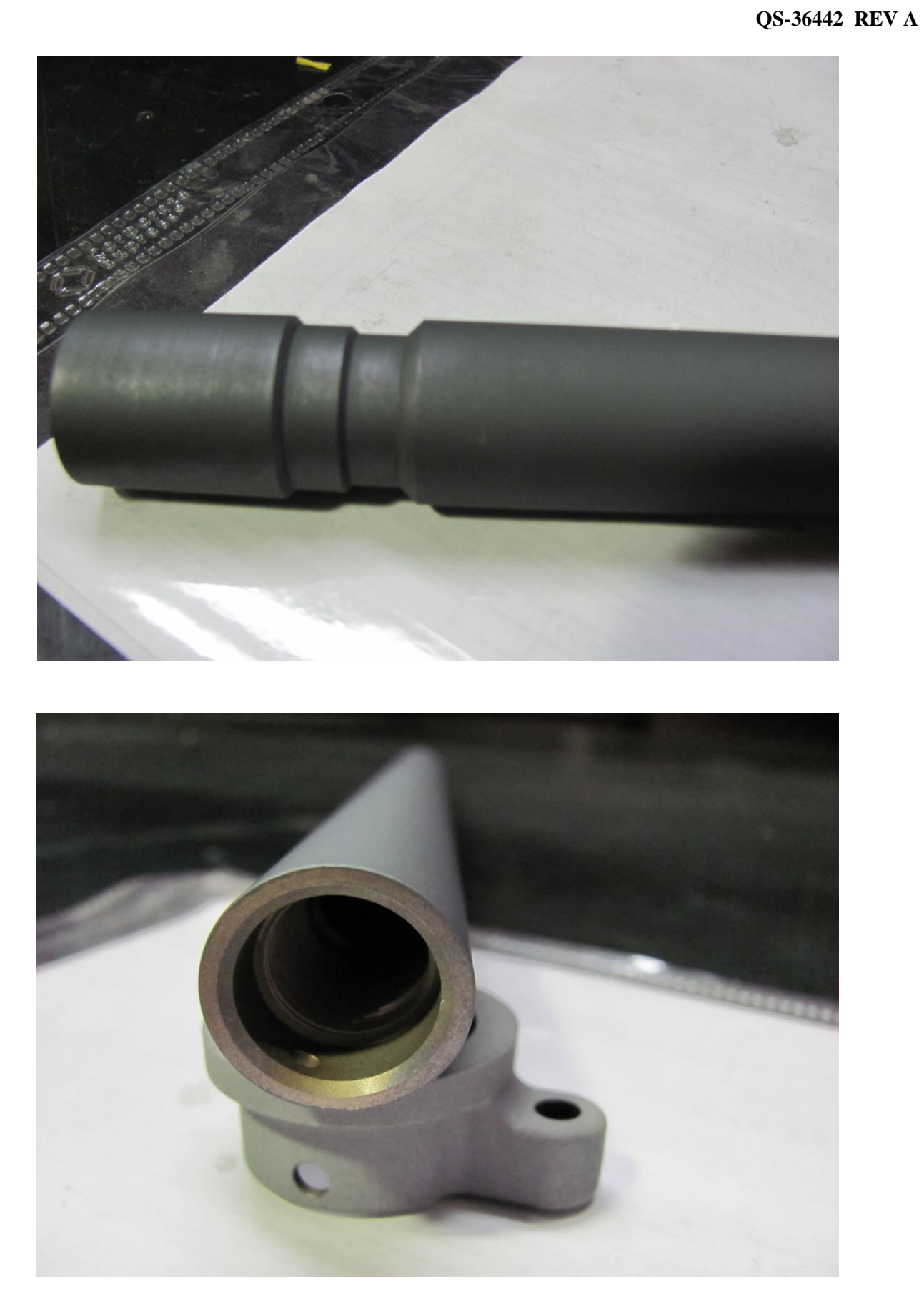
Page 10 Master copy is maintained on line – uncontrolled if printed