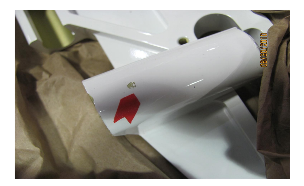
Page 7 Master copy is maintained on line – uncontrolled if printed