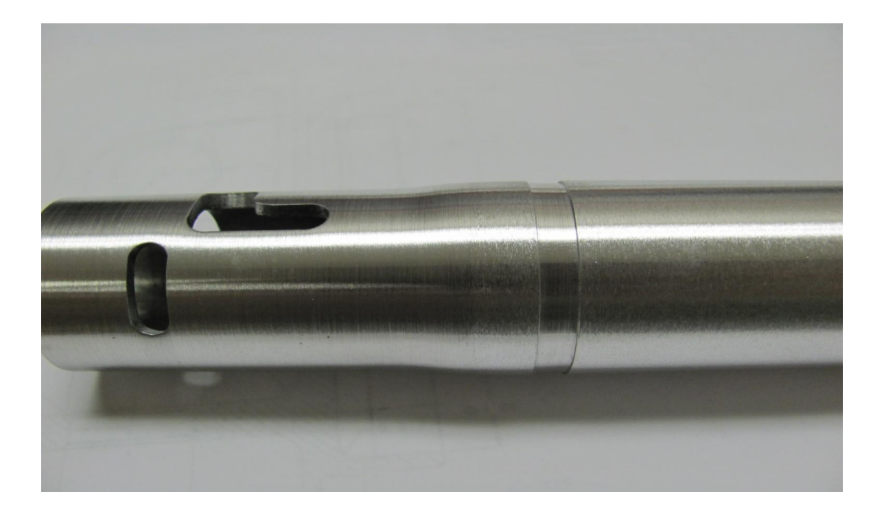
Page 8 Master copy is maintained on line – uncontrolled if printed