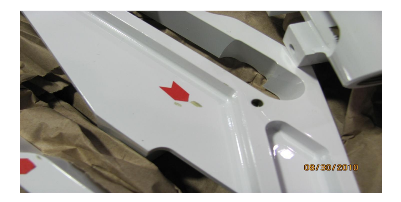
Gouges on Paint