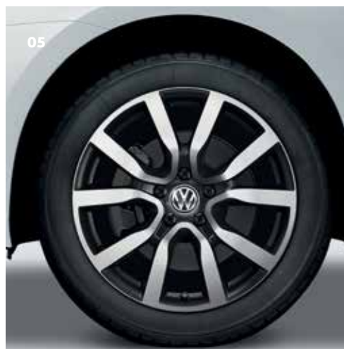
05 Serron, alloy wheel 18 inch, Black gloss machined Part. no. 5K0071498BAX1