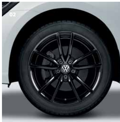
02 Pretoria, alloy wheel 18 inch, Black gloss Part. no. 5G0071498AAX1