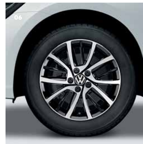
06 Blade, alloy wheel 17 inch, Black gloss machined Part. no. 5G0071497FZZ