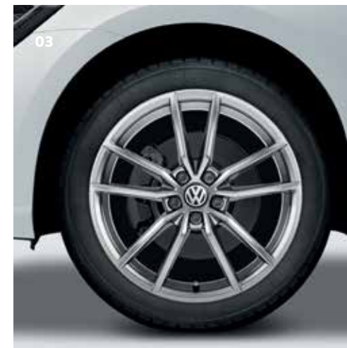
03 Pretoria, alloy wheel 18 inch, Sterling silver Part. no. 5G0071498A88Z