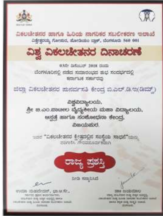
The District Disability Rehabilitation Centre of BLDE (Deemed to be University) received the State Award for “Best Service Providing Institution”.