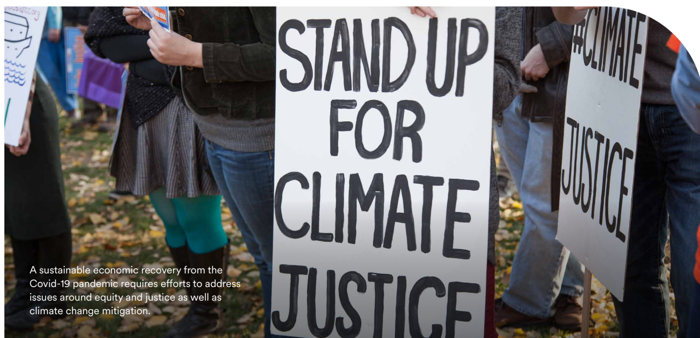
A sustainable economic recovery from the Covid-19 pandemic requires efforts to address issues around equity and justice as well as climate change mitigation.