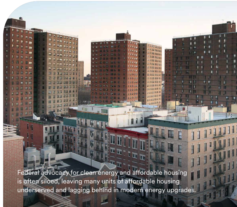
Federal advocacy for clean energy and affordable housing is often siloed, leaving many units of affordable housing underserved and lagging behind in modern energy upgrades.

These kinds of interventions at the state and local level could help alleviate the lack of affordable and energy efficient housing options in many cities across the world, especially as urbanization trends go up in the coming decades.