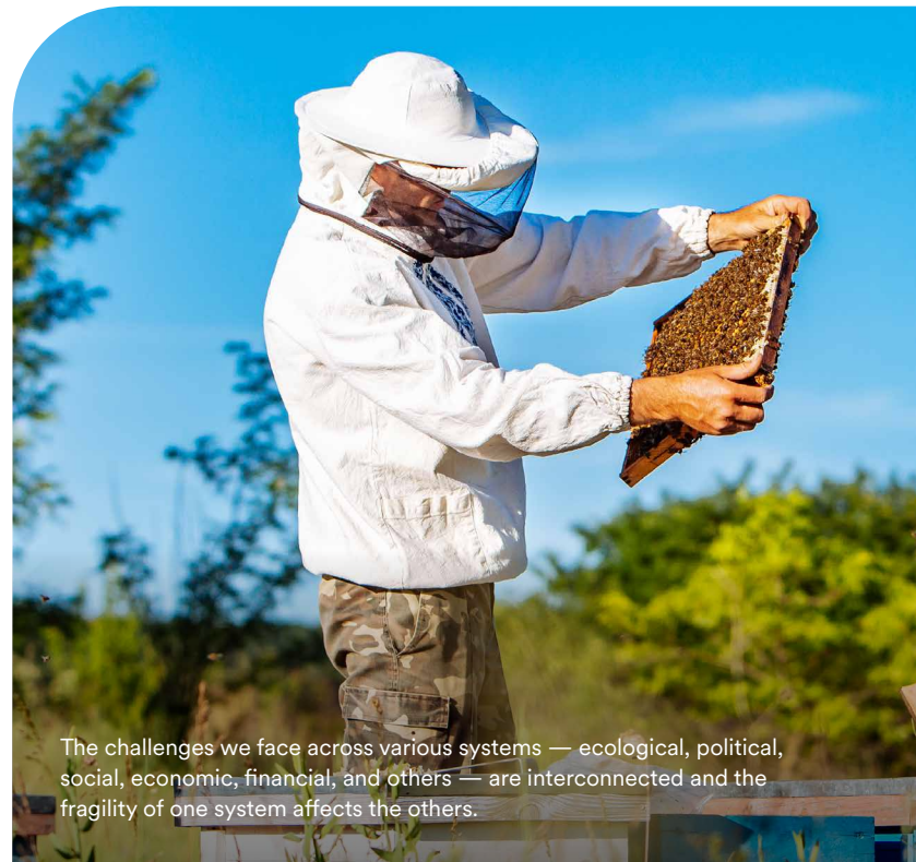
The challenges we face across various systems — ecological, political, social, economic, financial, and others — are interconnected and the fragility of one system affects the others.

In addition to government budgets, total philanthropic spending on all causes adds up to roughly $730 billion per year. This is not an inconsequential sum, but the fraction spent on climate change mitigation efforts, less than 2% of the total, is far too small. 5 Of that small fraction coming from foundations focused on climate mitigation that we track (totalling $1.6 billion in 2019), only around $60 million went to causes supporting climate justice, just transition to a low-emissions economy, grassroots mobilization, and equity — including strategies focused explicitly on communities that