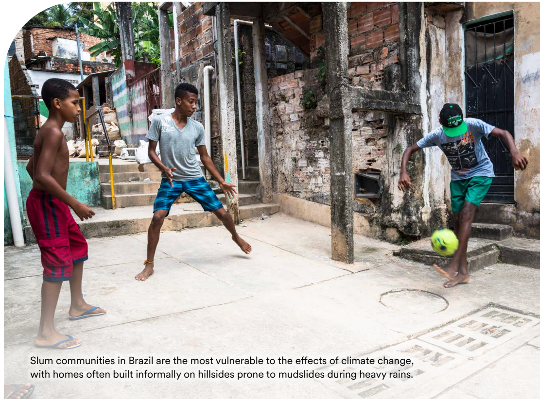
Slum communities in Brazil are the most vulnerable to the effects of climate change, with homes often built informally on hillsides prone to mudslides during heavy rains.

The confluence of race, poverty, and environmental injustice exist in Brazil in similar dynamics as in the U.S. Like the U.S., much of the “mainstream” environmental movement in Brazil continues to ignore the realities of racism and their influence on environmental policy. Civil society, both philanthropy and organizations working on development and climate, have an opportunity to highlight the struggles for livelihood and access to basic services in urban regions. Lending our voice and reputation to environmental justice struggles of Afro-Brazilians will be a watershed moment for the country’s environmental discourse. Official development plans, whether by municipalities or the Brazilian National Development Bank itself, have not considered regularizing favelas. This contributes to environmental racism and state violence as millions continue to live without basic modern services. Civil society can help to scale up and learn from these solutions, building on what is being done and helping to create formal policies for just sustainability, enhancing the qualities of favelas and their residents.