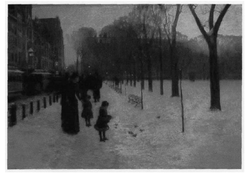
Frederick Childe Hassam. Boston Common at Twilight. Museum of Fine Art. Boston.