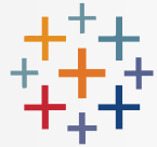
tableau ® CERTIFIED

Connect ANY reporting or visualization tool to ACL for unlimited reporting & visualizations