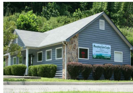
Mountain Care Center

In June of 2009, ACP opened a newly constructed academic building, "McGlothlin Hall." The new facility provides approximately 30,000 square feet and is the center of ACP's educational activities. McGlothlin Hall contains two large lecture halls, multiple purpose classrooms, faculty research facilities, conference room, the Academic Affairs Office, Office of the Dean, and faculty and staff offices. Architecturally, McGlothlin Hall was designed and constructed to complement Garden Hall and is named in honor and memory of Woodrow and Sally McGlothlin who supported education and Buchanan County throughout their adult lives.