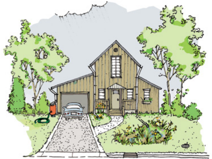
Left - stormwater runoff flows from this conventional home when rain hits the roof, walkway and driveway. It then funnels into the storm drain and nearby surface waters.