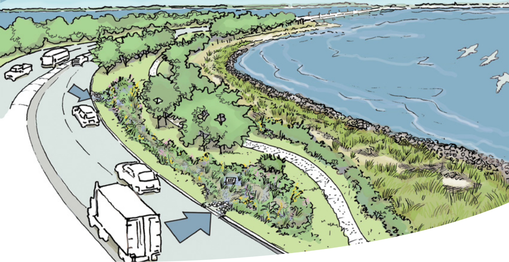
This road includes curb cuts to guide runoff to a roadside infiltration system. Permeable paving on the bike path disconnects runoff and a living shoreline reduces erosion to protect infrastructure.