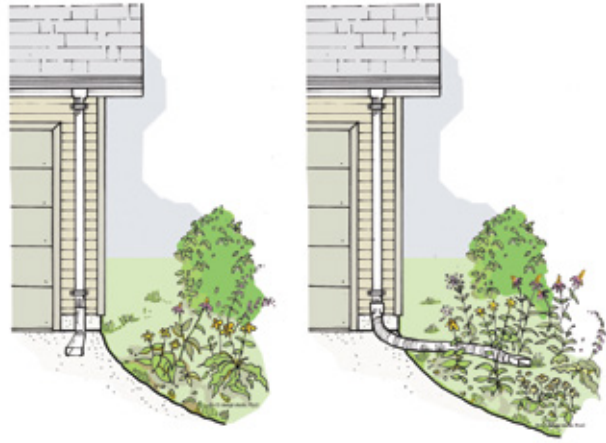
Using a downspout extender, roof runoff can be directed away from impervious surfaces to vegetated areas so the rain soaks into the ground. This is a simple and cost effective retrofit option. © L. BERKLEY, B+O: DESIGN STUDIO, PLLC

to filter through soil or other engineered material. There are a range of retrofit options, from simply redirecting downspouts to green spaces to resurfacing parking lots. This range of nature-based stormwater strategies are financially feasible and can provide savings over repairing and replacing traditional stormwater infrastructure, when designed and sited right, based upon factors such as average precipitation rates and soil type. By choosing nature-based stormwater strategies supported by the state 16 , local and downstream communities will be more resilient to future climate conditions. The following recommendations reflect the most critical actions to employ nature-based strategies in stormwater retrofits whenever practicable.