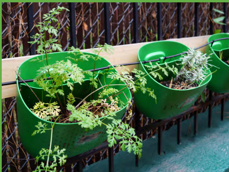
The children at the center helped plant different herbs and vegetables, such as peas, lettuce, rosemary, carrots, broccoli, lavender and tomatoes. Each classroom maintains six bins.

When the center tried to install the vertical garden materials, they realized that the materials they bought did not work with their fence. Their custodian suggested hanging wooden beams across the posts on the fence. He was then able to attach the bins to the wooden beams. After the system was set up, the children were able to sow seeds and watch plants grow!