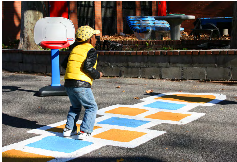
Salvation Army Early Childhood Center in Brownsville has painted playground markings in their outdoor space where the children play hopscotch and other games.