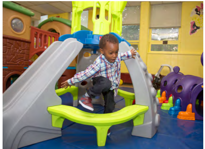
United Community Day Care Center in Brooklyn (left) and QSAC (right) provide indoor play materials and structures to get their children climbing and crawling.