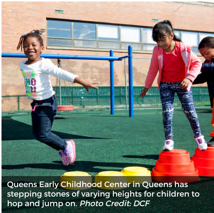
Queens Early Childhood Center in Queens has stepping stones of varying heights for children to hop and jump on.

Active design is an approach to the development and design of buildings, streets and neighborhoods that makes daily physical activity and healthy foods and beverages more accessible and appealing.