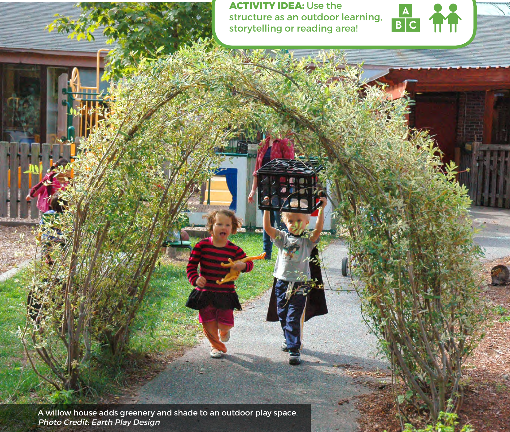
A willow house adds greenery and shade to an outdoor play space.