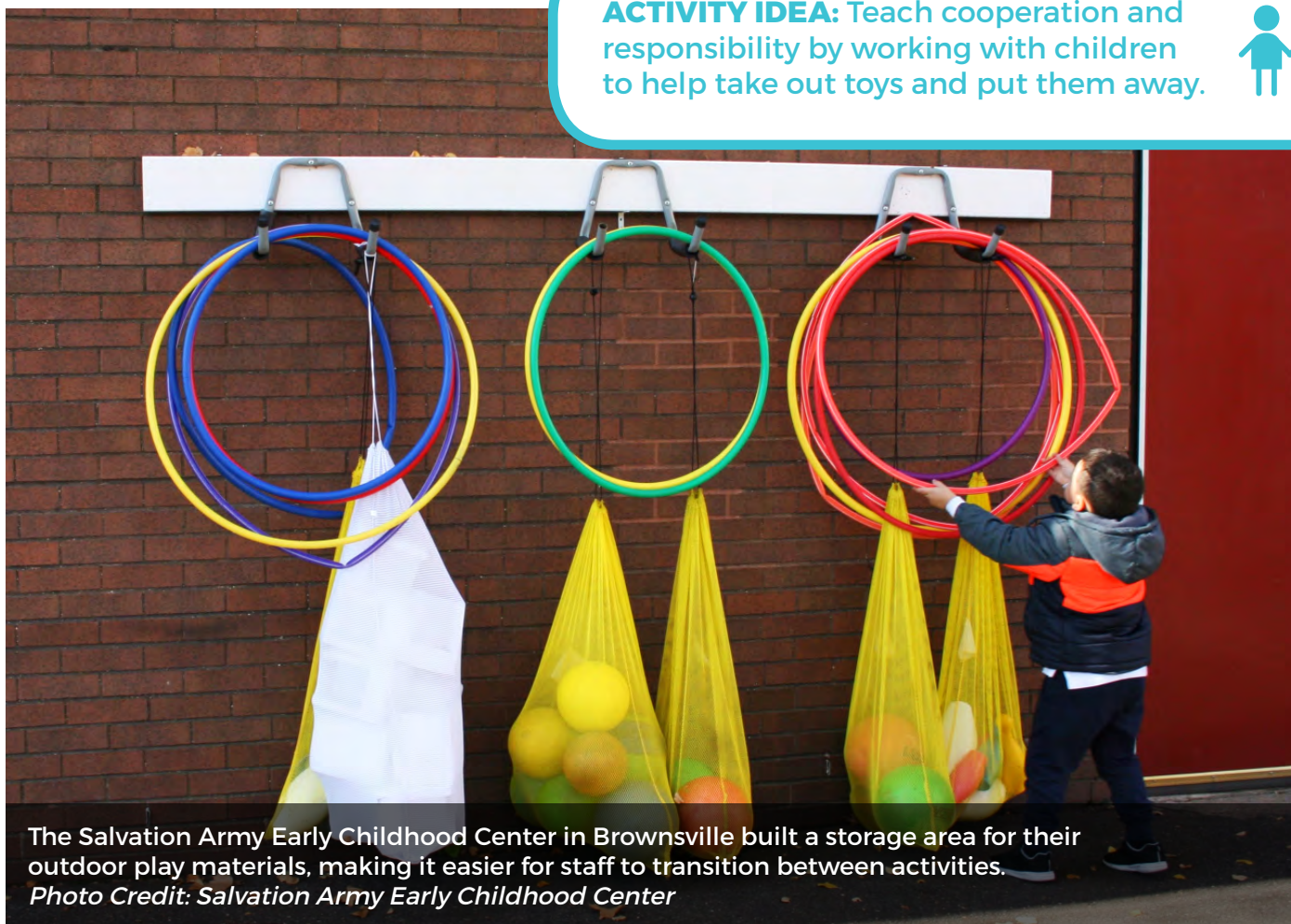
The Salvation Army Early Childhood Center in Brownsville built a storage area for their outdoor play materials, making it easier for staff to transition between activities.