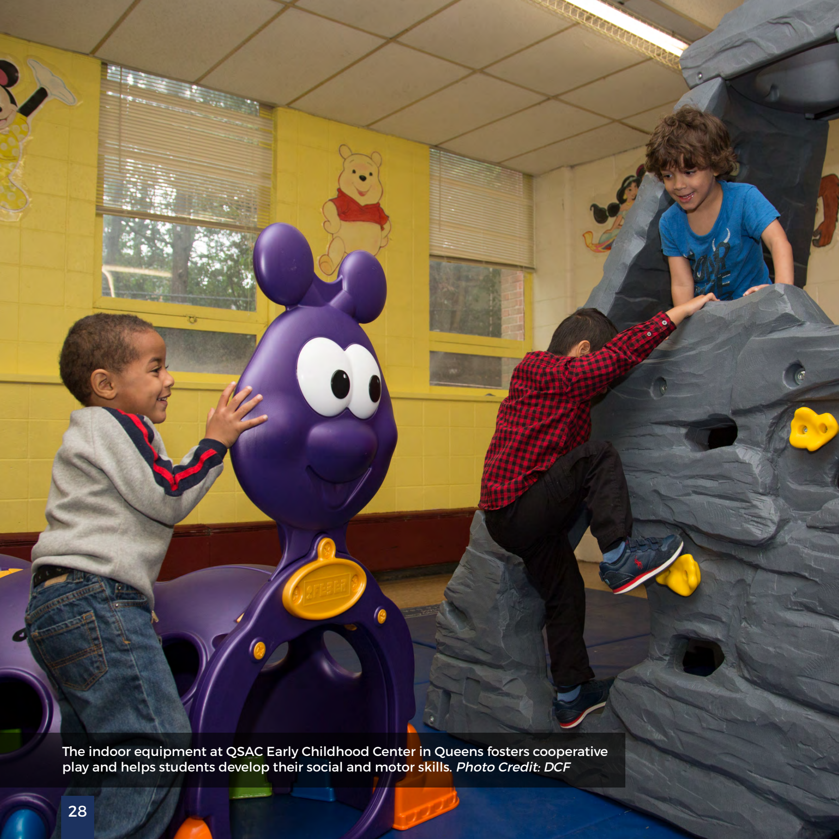
The indoor equipment at QSAC Early Childhood Center in Queens fosters cooperative play and helps students develop their social and motor skills.