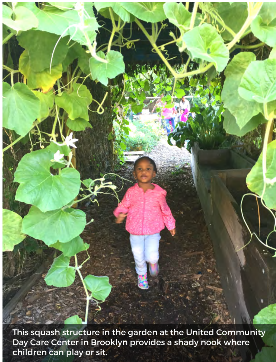
This squash structure in the garden at the United Community Day Care Center in Brooklyn provides a shady nook where children can play or sit.

Visit the Head Start website at eclkc.ohs.acf.hhs.gov/hslc and search “poisonous plants” to find a list of safe non-poisonous plants and poisonous plants to avoid.