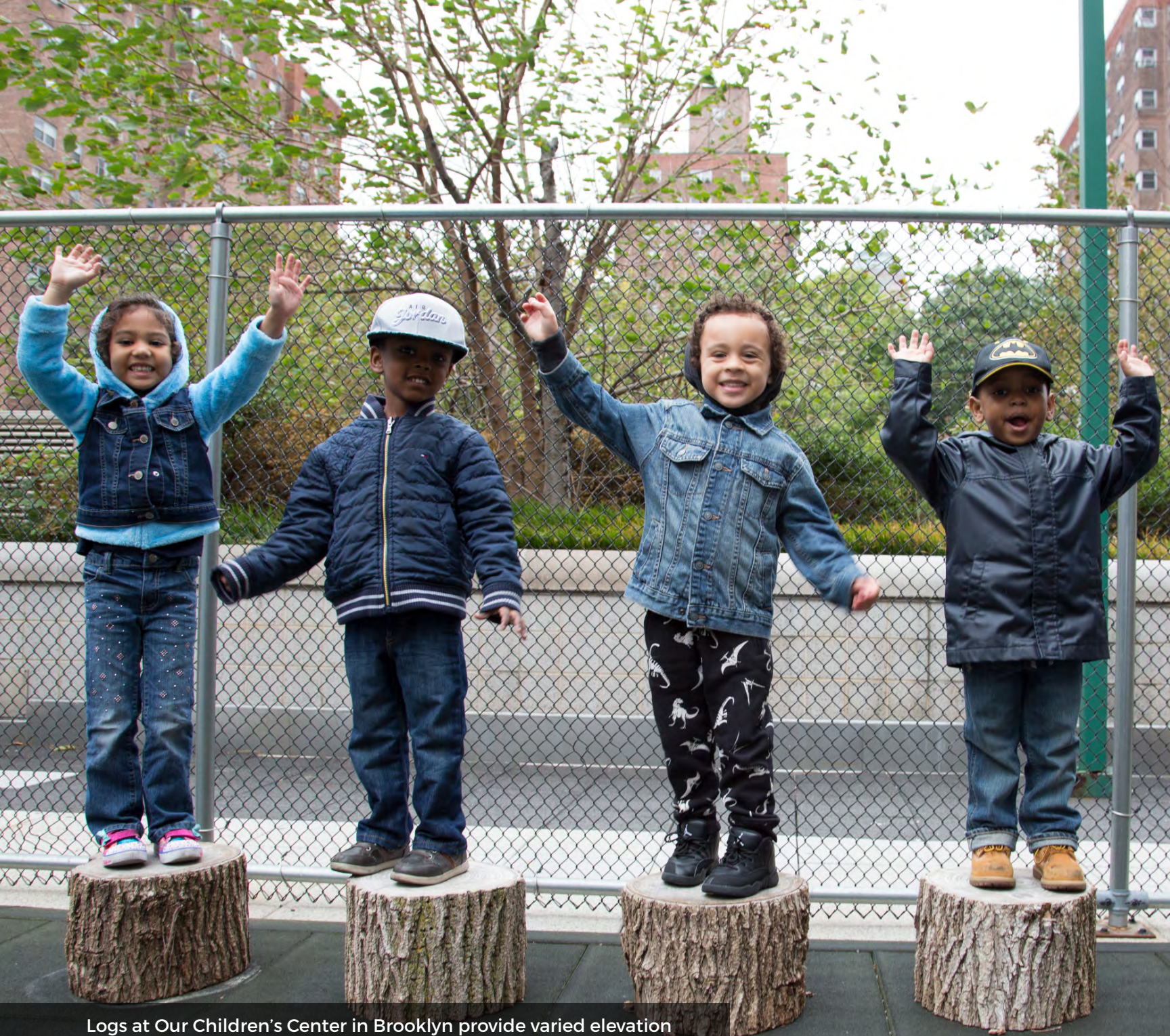
Logs at Our Children's Center in Brooklyn provide varied elevation for children to develop gross motor skills, while introducing natural elements to their outdoor playground.