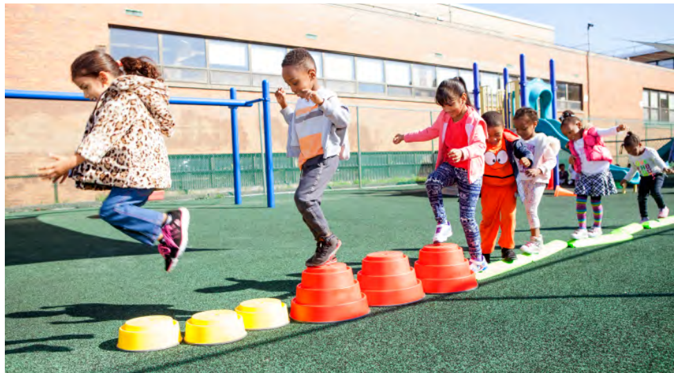
Queens Early Childhood Center in Queens uses varied elevation stepping stones in their outdoor play area, which help with the children's balancing skills.