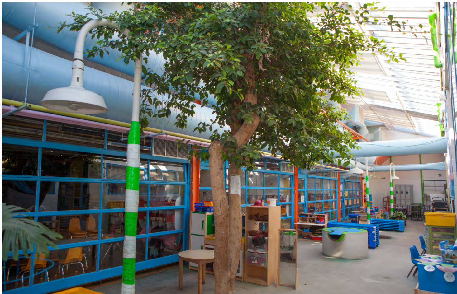
United Community Day Care Center in Brooklyn grows herbs and avocado, palm and ficus trees in their indoor space so children can be around nature even when they cannot go outside.