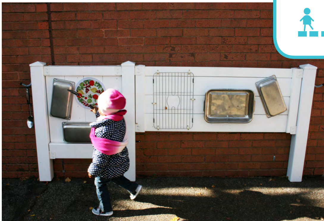
Parents donated materials for this music wall at the Salvation Army Early Childhood Center in Brownsville, Brooklyn.

When the music starts up again, they keep going!