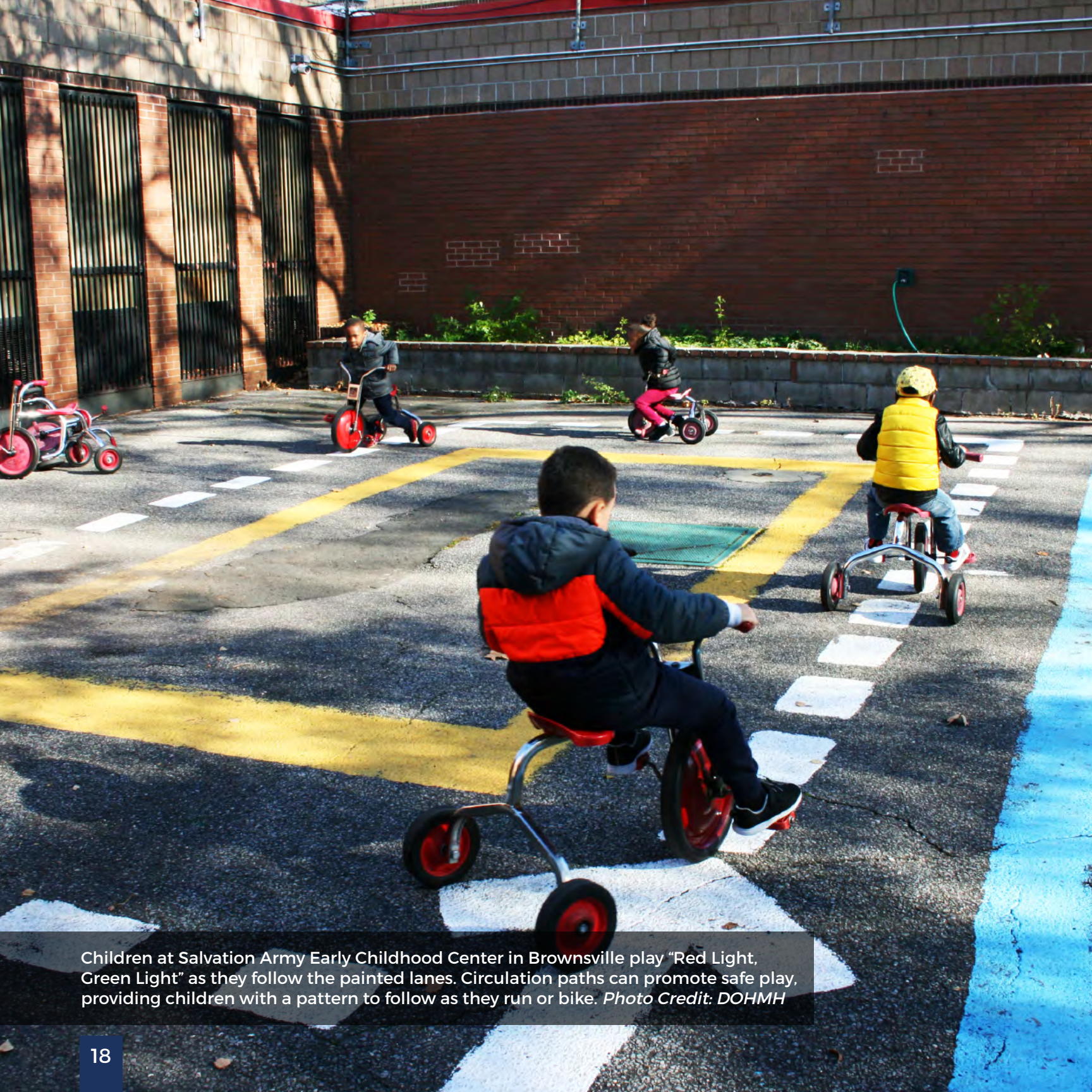
Children at Salvation Army Early Childhood Center in Brownsville play “Red Light, Green Light” as they follow the painted lanes. Circulation paths can promote safe play, providing children with a pattern to follow as they run or bike.