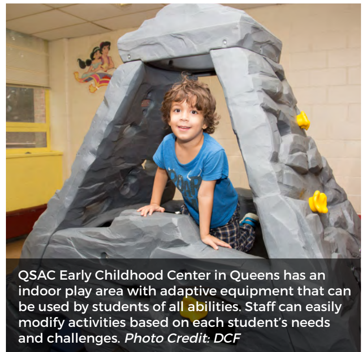
QSAC Early Childhood Center in Queens has an indoor play area with adaptive equipment that can be used by students of all abilities. Staff can easily modify activities based on each student's needs and challenges.