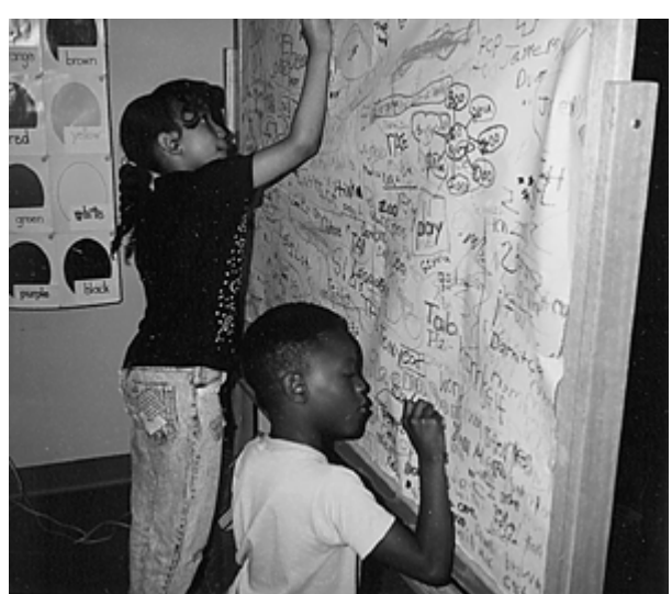
The relation of thought to word is not a thing but a process.

Children learn not only the language system of those around them but also the values and attitudes that are inherent in the way language is used. If we don't talk to children except to give them orders, they will grow up to learn that language is used mainly to control. They may never learn that they can use language to explore and learn about their world. However, if children are accustomed to engaging in talk that allows them to express what they think, to ask questions, to reflect on their thinking, and to form new ideas, they will learn the value of