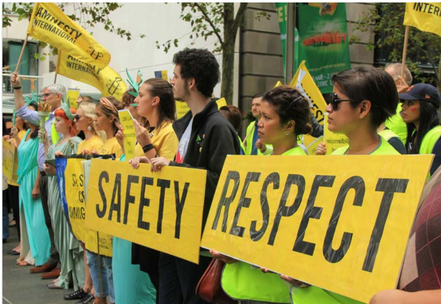
Activists and staff call on the US to end a discriminatory travel ban on six majority-Muslim countries, Sydney, March 2017. Cover: A 'Bring Them Here' rally for the people imprisoned on Manus and Nauru.