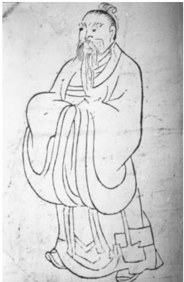
Figure 3. Bian Que (Qin Yueren), the well-known physician who was skilful in acupuncture, and lived circa 500BC.

The most important and influential work of this period is the Huangdi Neijing (Yellow Emperor's Internal Classic), previously referred to in this text. Although it is said to have been written by the legendary Yellow Emperor, it was predominantly the work of a number of scholars and physicians living between the 5th and 1st