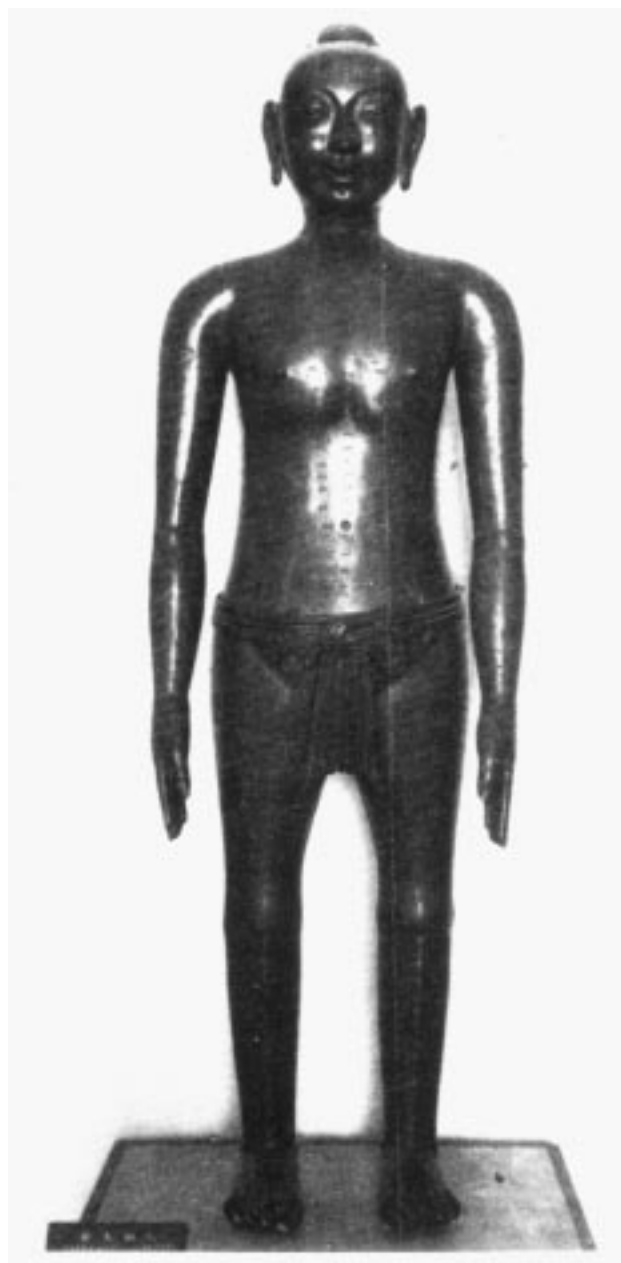
Figure 4. This bronze acupuncture figure is a reproduction based on the one cast in 1443AD during the Ming dynasty.

Further evidence of official attention paid to acupuncture can be found in the preface of a