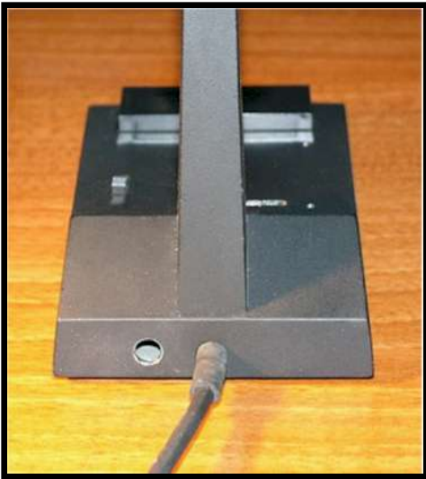
Figure 3. New Cable Exit Hole