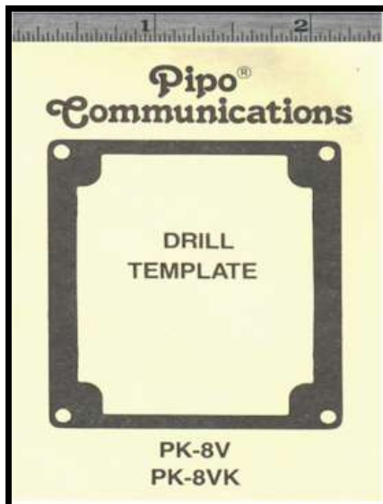
Figure 1. Drilling template

Completed installation on the author's Turner 752 microphone. The original labeling of the right column of keys on the Pipo keypad, "A" through "D," was scraped off with an Exacto knife and the appropriate function labeling STO (Store), RCL (Recall), STP (Step) and CLR (Clear), has been applied to the base with dry transfer labeling