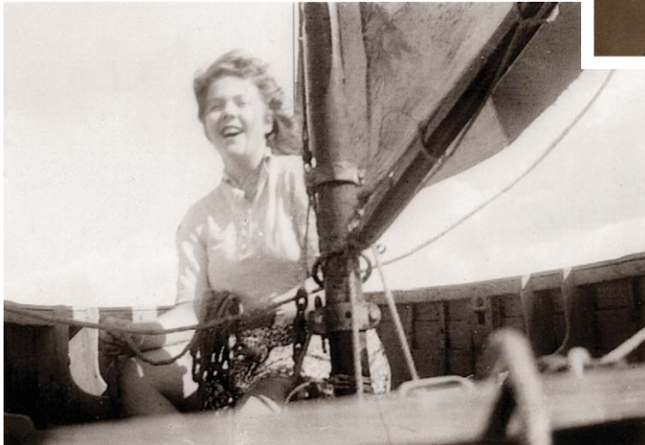
Sailing in Trincomalee harbour, Ceylon (now Sri Lanka)