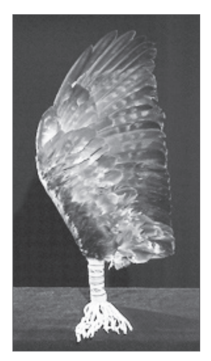
Eagle Wing Fan Crow Not dated Golden eagle wing, cut glass beads (gourd stitch), native tanned leather, thread 41 x 16-1/2 inches University of Wyoming Art Museum, Peter W. Doss Crow Indian Artifact Collection, no. 27

choice of adornment say about you and your place within your culture?