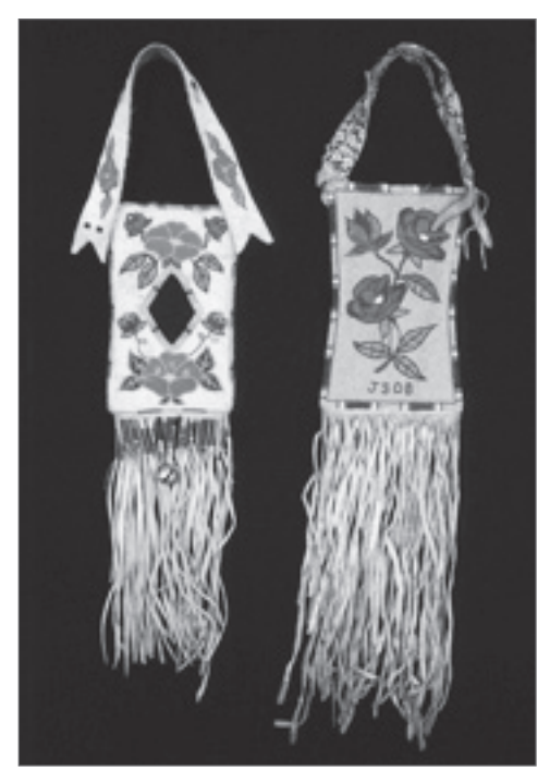
Mirror Case Crow, Not dated Hide, seed beads (Crow stitch), straw beads, cloth, bell, thread 5 x 18 inches University of Wyoming Art Museum, Peter W. Doss Crow Indian Artifact Collection, no. 159

The Plains Indians, with their love for decoration, wore all types of jewelry. Both men and women prized necklaces made of shells, bones, quills, beads, animal claws, teeth, antlers, and fur.