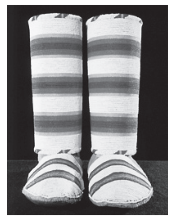
Woman's Leggings and Moccasins, Crow Not dated Seed beads (spot stitch), sinew, leather 9-1/2 \times 13 inches, leggings; 7-1/2 \times 10 \times 4-1/2 inches, moccasins University of Wyoming Art Museum, Peter W. Doss Crow Indian Artifact Collection, no. 239, 384c

In North American Indian tribes, bear claw necklaces were worn by a variety of religious and war leaders. Men's societies of bear healers and bear