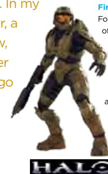
RIGHT Master Chief Petty Officer John-117, the protagonist of Halo and a video game icon.