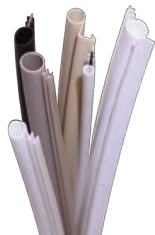
Hollow Bulb Seals