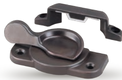
Lock and Keepers