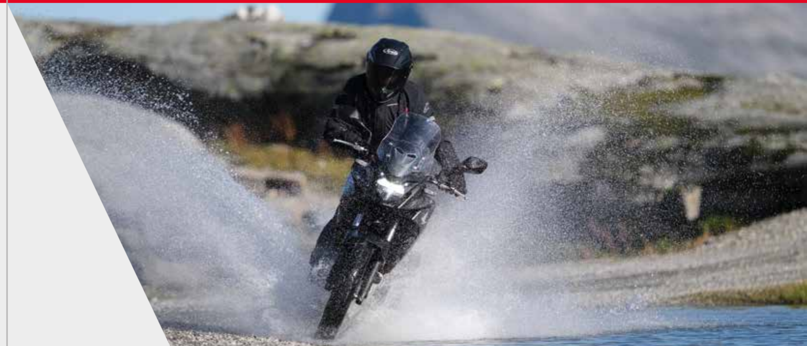
Location photos show 19YM CB500X