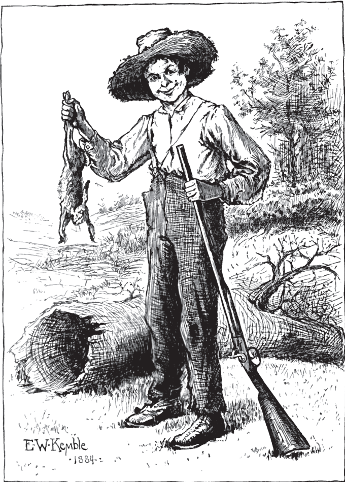
Illustration by E. W. Kemble from the first edition of Adventures of Huckleberry Finn