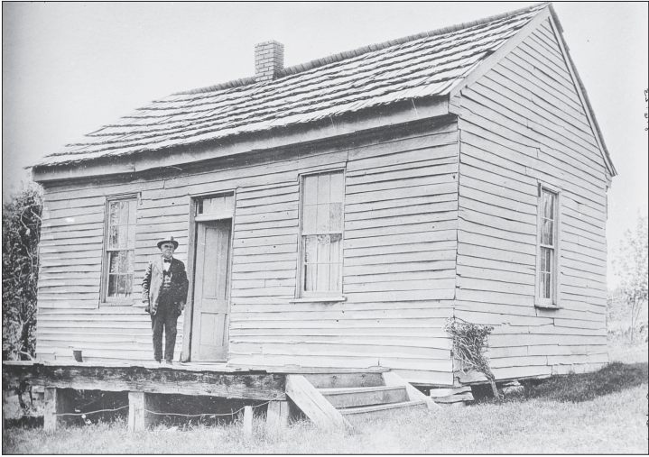
Twain's birthplace in Florida, Missouri (above) and his house in Hartford, Connecticut (below)