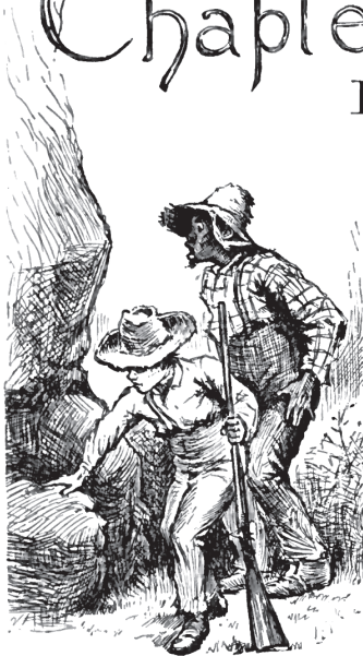
EXPLORING THE CAVE.

I WANTED to go and look at a place right about the middle of the island, that I'd found when I was exploring; so we started, and soon got to it, because the island was only three miles long and a quarter of a mile wide.