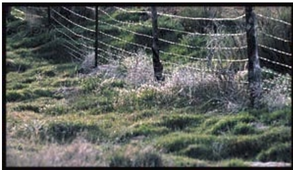
Barbed wire recently restrung on ancient fence posts. The fence exists ten feet into an adjoining property. Adverse possession or a permissive use?

Of note, in the United States, where title to property is held under a Torrens title (also called land registration or land court title), adverse rights cannot be advanced. Although not common, at this date, twenty states have passed land registration systems. Those states are California, Colorado, Georgia, Hawaii, Illinois, Massachusetts, Minnesota, Mississippi, Nebraska, New York, North Dakota, Ohio, Oregon, South Carolina, South Dakota, Tennessee, Utah, Virginia and Washington. In 1958 California repealed its act for lack of use. Even in states with Torrens titles, the majority of real property is not held under such title. When investigating claims of adverse possession, the surveyor must be aware of whether a given parcel is effected by such registration.