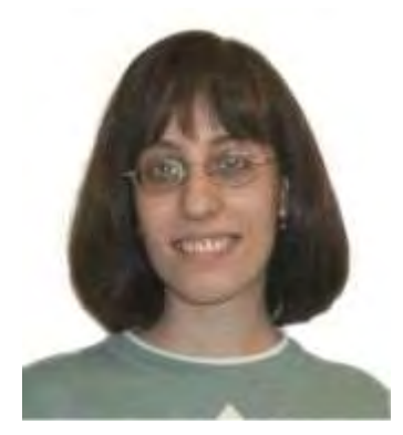
Algorithm design and analysis; pattern matching algorithms; computational biology; data compression.

sokol@sci.brooklyn.cuny.edu 3209dN 951-5000 x2065