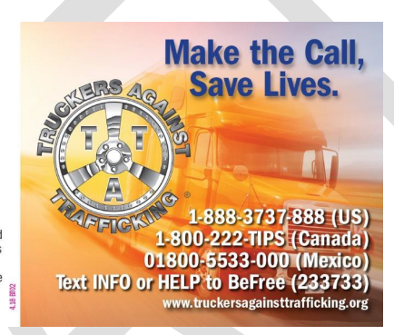
Wallet Card – Front