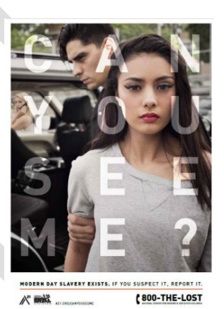
Can You See Me? Posters