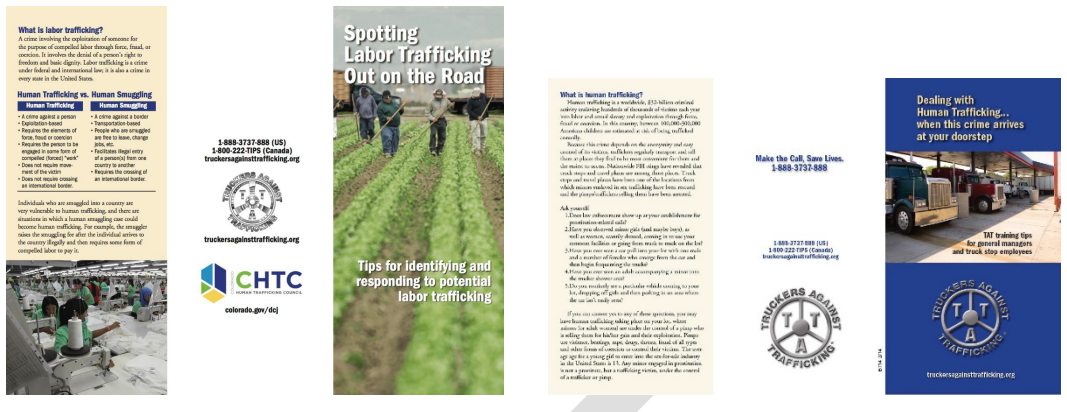
Labor Trafficking Brochure – Outside