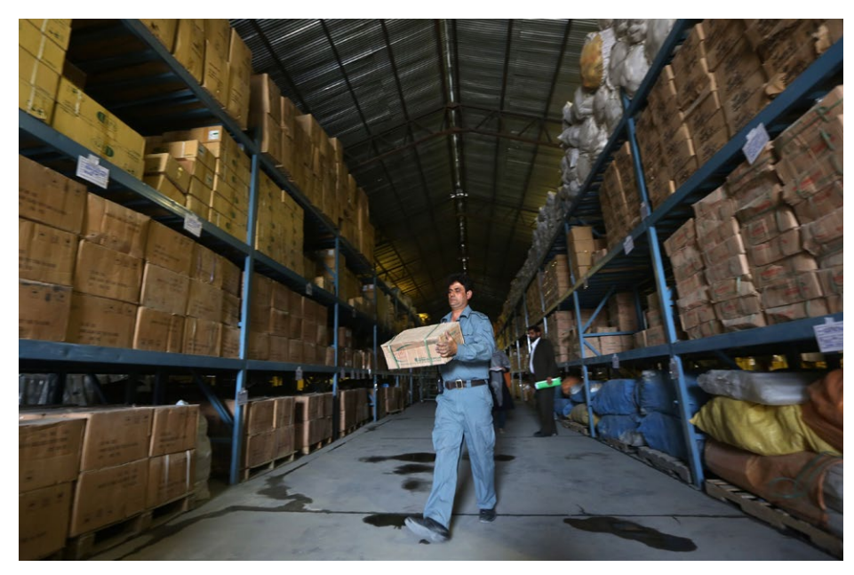
SUPPLY LINES: The new police medical supply warehouses in Kabul (above and below) are an improvement, say coalition advisors, but there are still difficulties getting medicines and supplies to police clinics around the country.

As coalition facilities close down and the number of soldiers and police wounded in battles with the Taliban rises, Afghan security forces are increasingly turning to civilian hospitals for help. With the number of