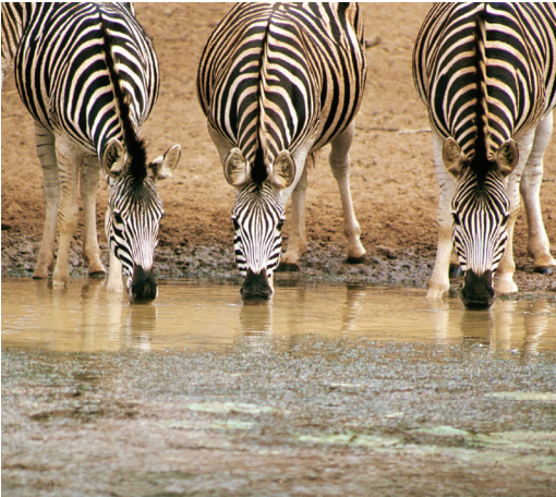
Zebra roam freely in Chobe National Park.

Day 14: Arrive U.S. We arrive in the U.S. this morning and connect with our flights home.