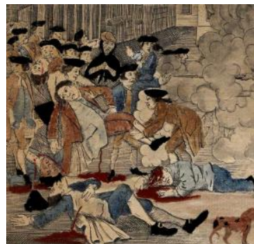
Detail of Crispus Attucks' death from "The Bloody Massacre" by Paul Revere, 1770.

From the first shots of the American Revolutionary War until the ultimate victory at Yorktown, black men significantly contributed to securing independence for the United States from Great Britain. On March 5, 1770, Crispus Attucks, an escaped slave, was at the center of what became known as the Boston Massacre that fanned the flames of revolution. Once the rebellion began, Prince Estabrook, another African American, was one of the first to fall on Lexington Green in Massachusetts on April 19, 1775. Other black men fought to defend nearby Concord Bridge later in the day.