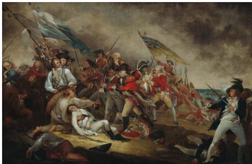
"The Death of General Warren at the Battle of Bunker's Hill, June 17, 1775" by John Trumbull, post 1815. (Museum of Fine Arts, Boston)

At least a dozen black men fought at the Battle of Bunker and Breeds Hill the following June 17. Cuff Whittenmore was cited for "fighting bravely" and allowed to keep a sword he captured from a British officer. Another black soldier, Peter Salem, a veteran of the Battle of Concord Bridge, killed yet another senior British officer in the fight. Later, fourteen American officers signed a document recognizing Salem Poor for being "a brave and gallant soldier." In the famous painting of the battle by John Trumbull, two African Americans are included in the scene.