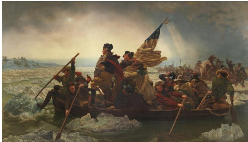
"Washington Crossing the Delaware" by Emanuel Leutze, 1851.

black soldier at Washington's side in their boat as they crossed the river to earn a much-needed victory at Trenton, New Jersey, on December 26, 1776.