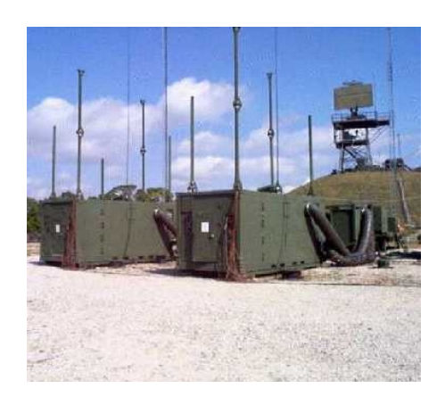
AN/TYQ-23 Modular Control Equipment