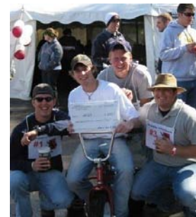
Above: Members of AFST at Homecoming. Winners of the Tricycle Race

We ask that you please provide any information about yourself, and if it is historical to the FSE program any information about the document, picture, or item you have sent. We appreciate the assistance of our Alumni because you hold the key to our past, and in order to continue with our future we must know where we have come from.