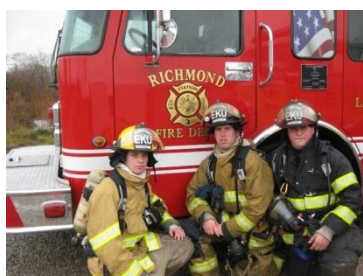
Below: Members of AFST and Richmond Co-Ops at a training