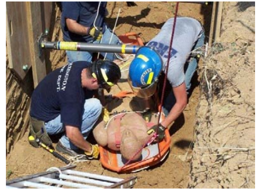
Above: Trench Rescue at Rescue School 2008.

2008 Rescue School marked the 27 th year and was a great success and has continued to build upon providing training to first responders and rescue squads from around the state of Kentucky. There were 2 and 3 day courses that all went very well. Some classes included in Rescue School were EMT Refresher, Wide Area Search Course, Rope Assisted Rescue, Incident Safety Officer, Trench Rescue, Dragging Operations and Inland Water Search. Again, this weekend went very well and was successful for all who attended.