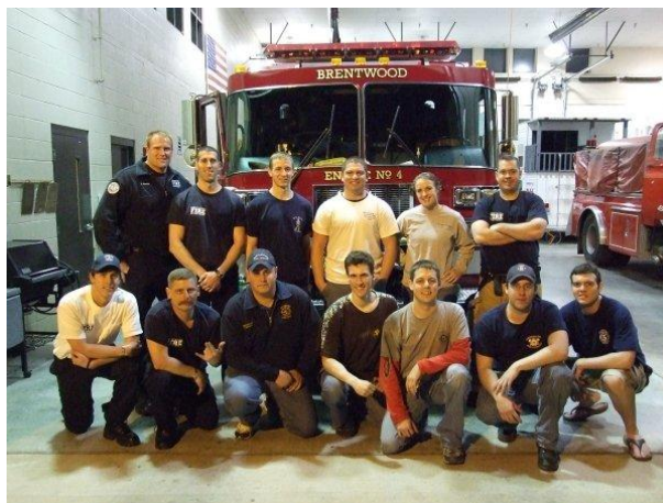
Left: Members of AFST with the Brentwood, Tennessee Fire Department for a Training.