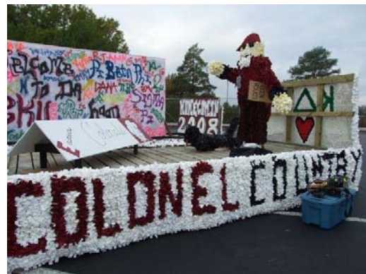
Above: 2008 Homecoming Float