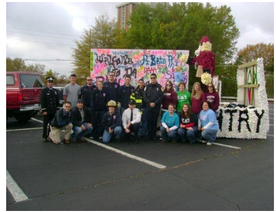
Above: Members of AFST & KDT at Homecoming with the float! First Place!

We again have continued the tradition of teaming up with the Kappa Delta Tau's and were able to maintain our strong hold on having the best homecoming float in the homecoming parade. This year we again made a float that moved and provided an adequate theme to making the animation of the Colonel Kicking the panther.